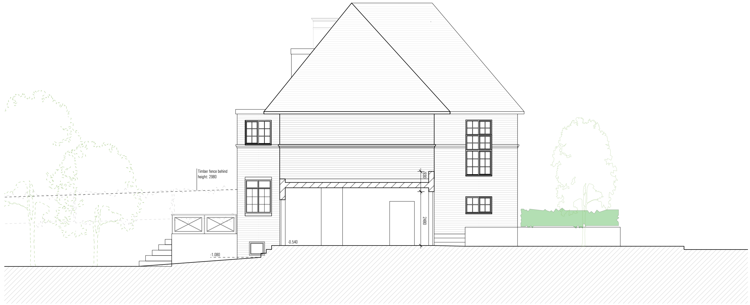
Side Elevation Scale 1:100@A3

Revisions: 05.06.2017 12 - Added fence behind elevation