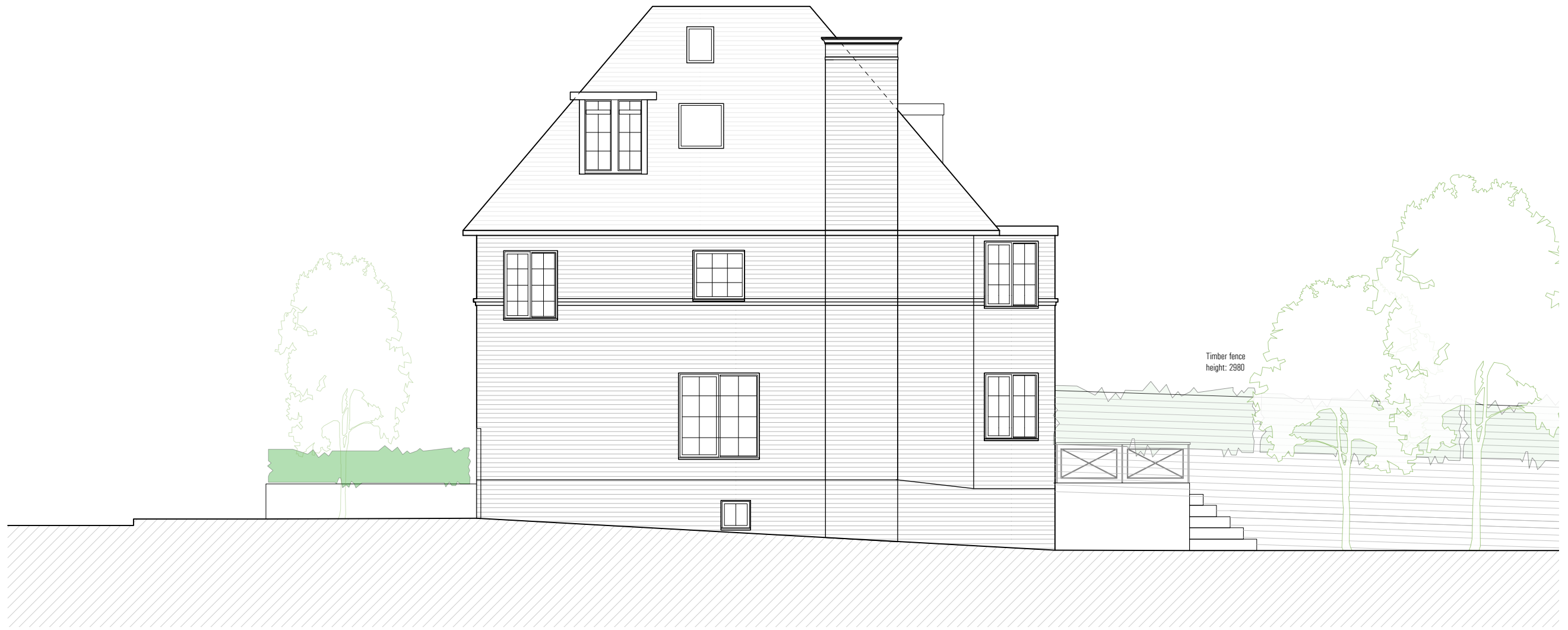
Side Elevation Scale 1:100@A3

Revisions: 05.06.2017 I2 - Added fence behind elevation