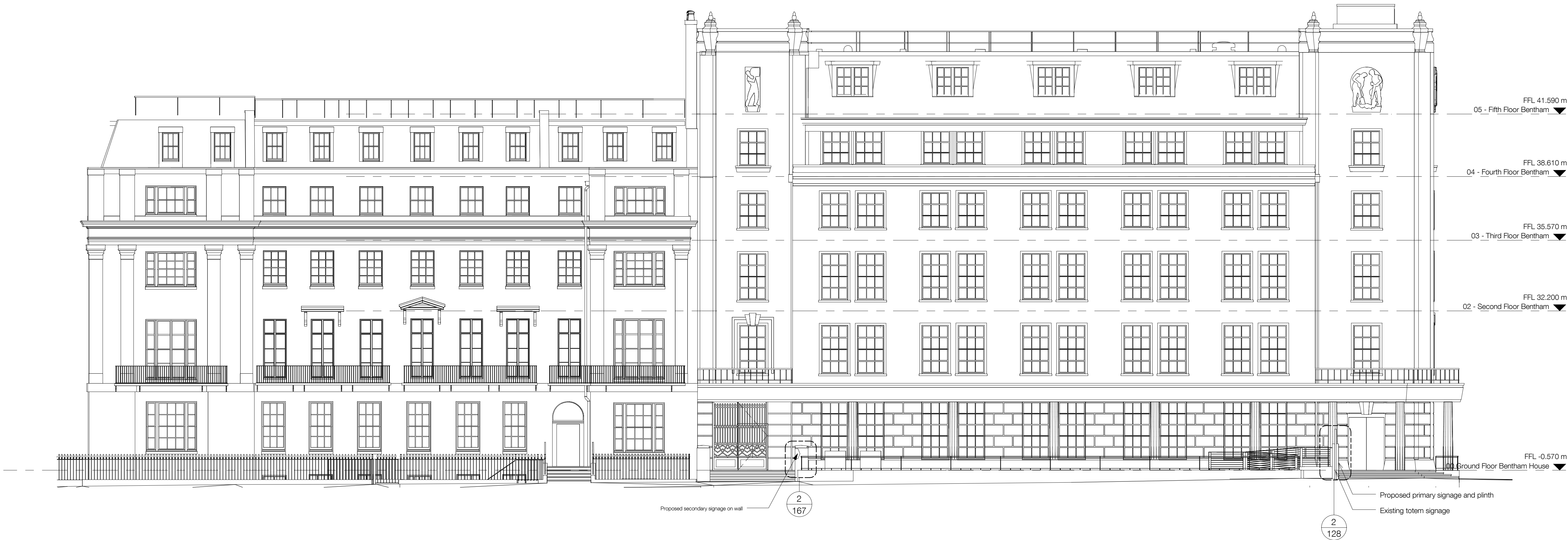
1 North West Elevation 1 : 100