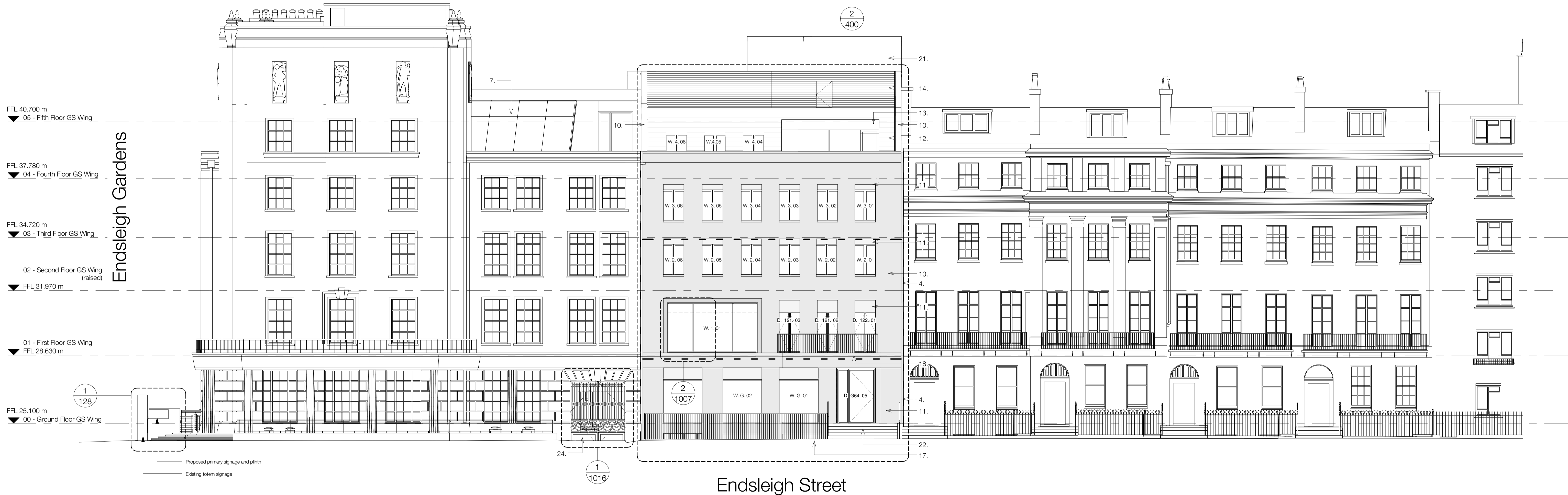
1 South West Elevation Proposed 1 : 100