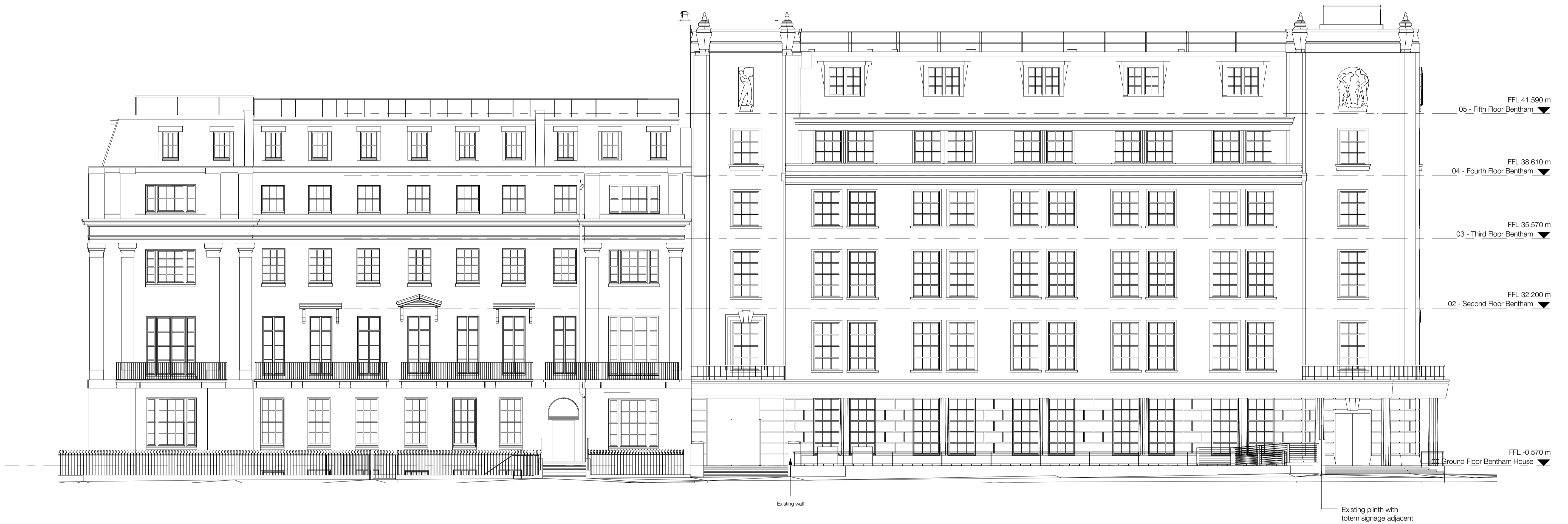
1 Existing North West Elevation 1 : 100