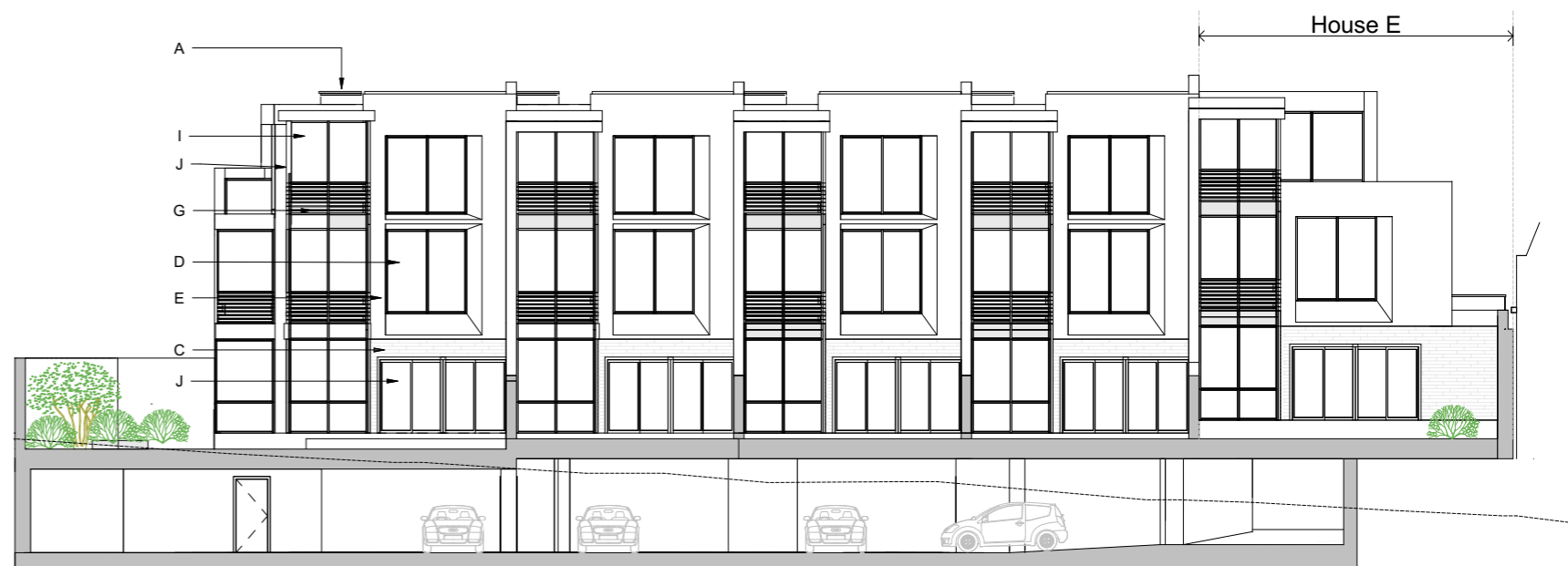
WEST ELEVATION (BACK) PRIVATE GARDENS 1 : 200