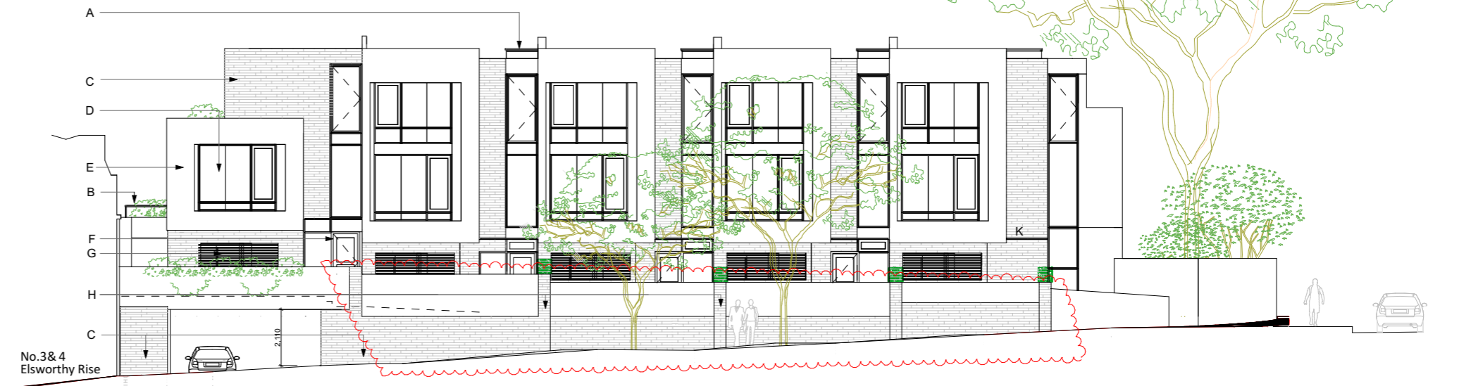
EAST ELEVATION (FRONT) ELSWORTHY RISE 1 : 200