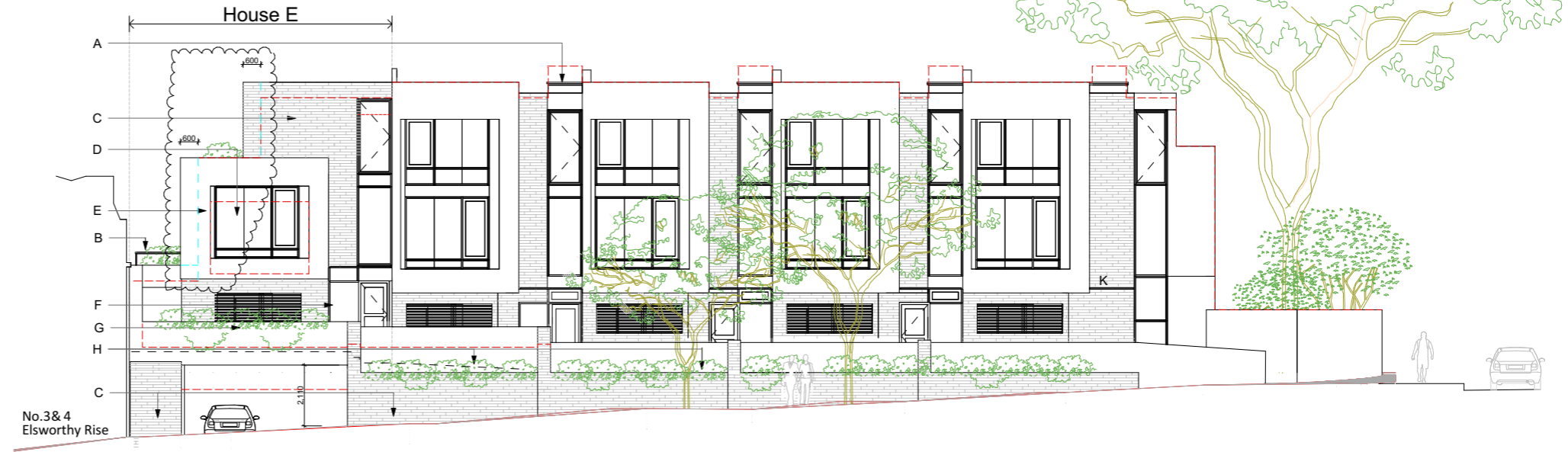
EAST ELEVATION (FRONT) ELSWORTHY RISE 1 : 200