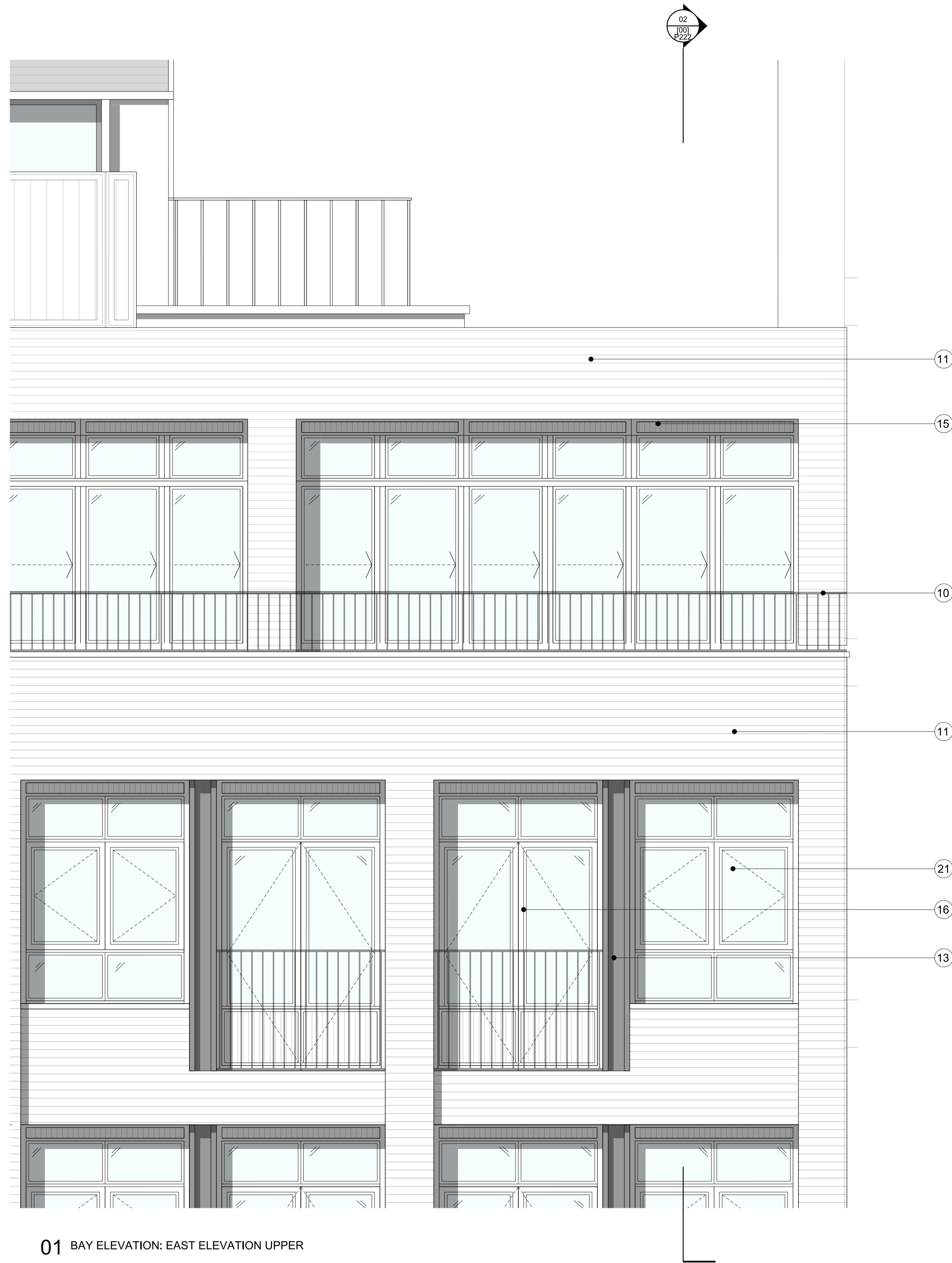
01 BAY ELEVATION: EAST ELEVATION UPPER