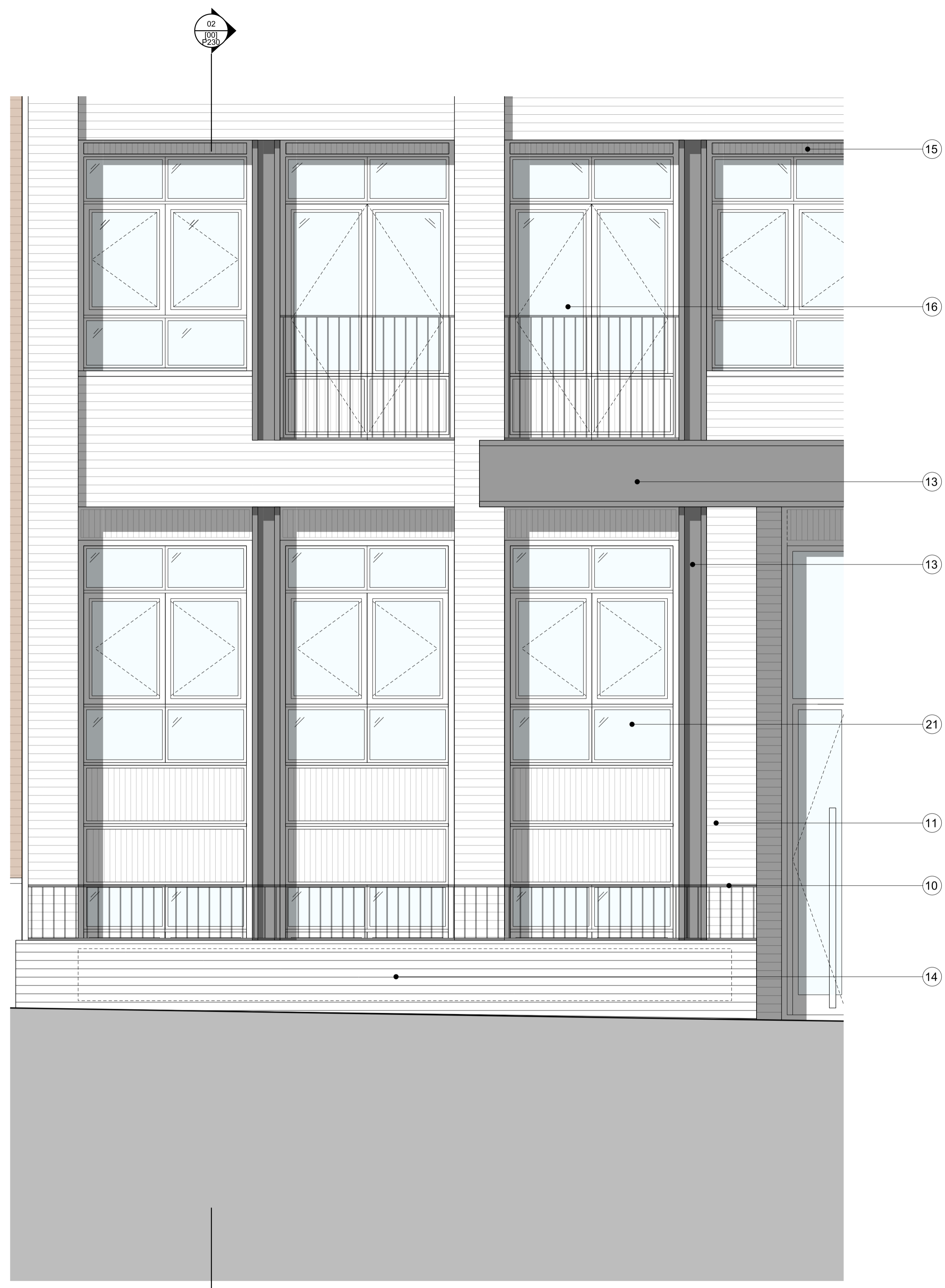
01 BAY ELEVATION: EAST ELEVATION LOWER