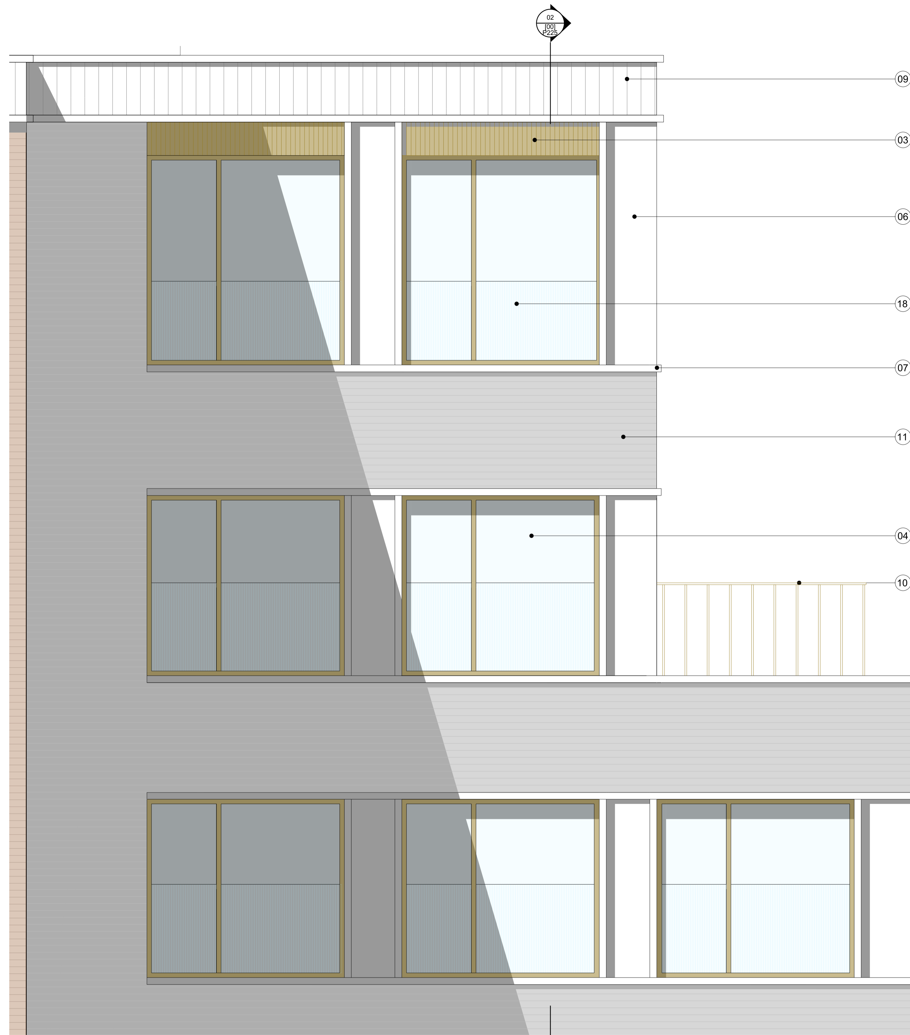
01 BAY ELEVATION: EAST ELEVATION UPPER