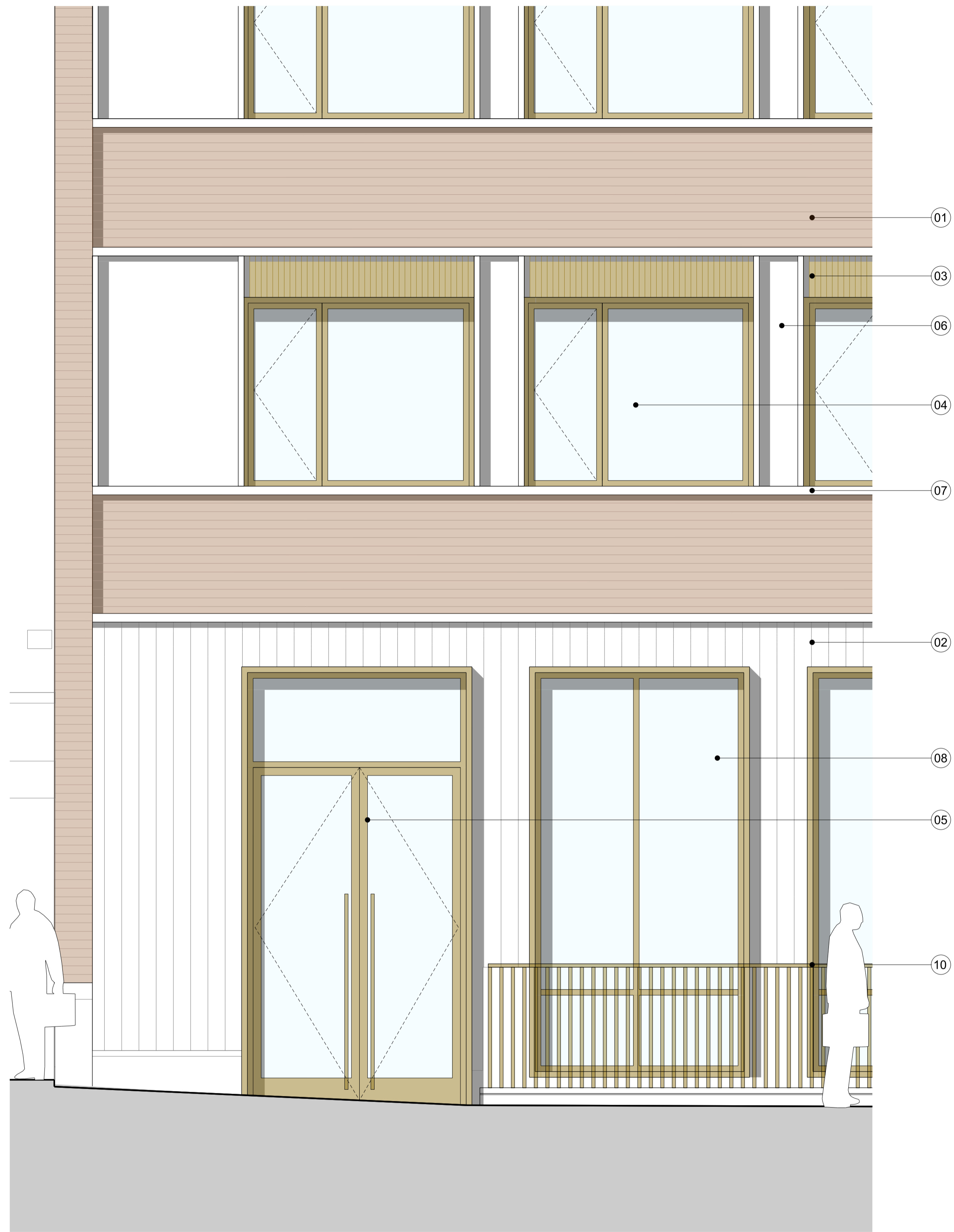
01 BAY ELEVATION: SOUTH ELEVATION POTENTIAL GP ENTRANCE/FIRE ESCAPE