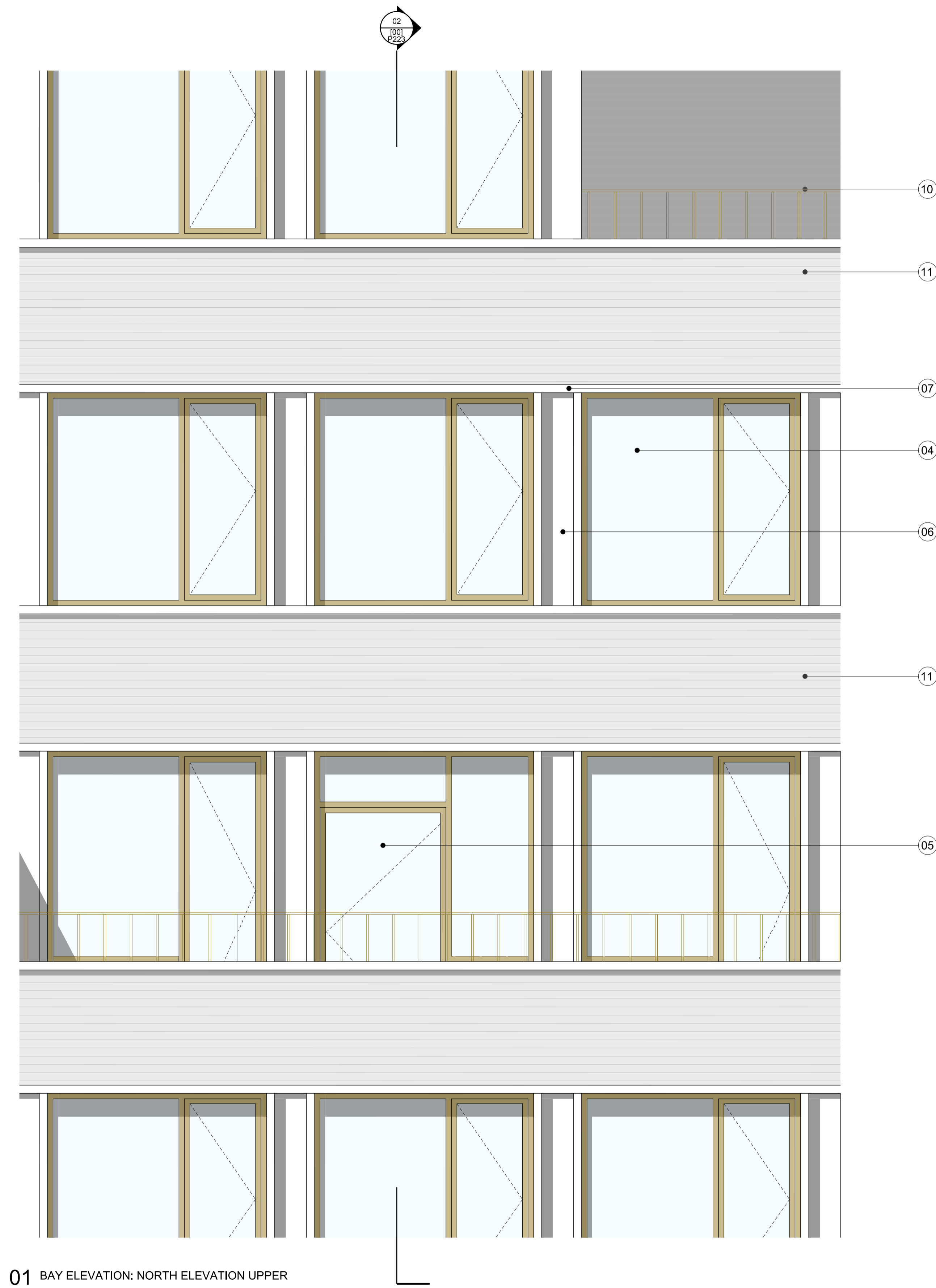
01 BAY ELEVATION: NORTH ELEVATION UPPER