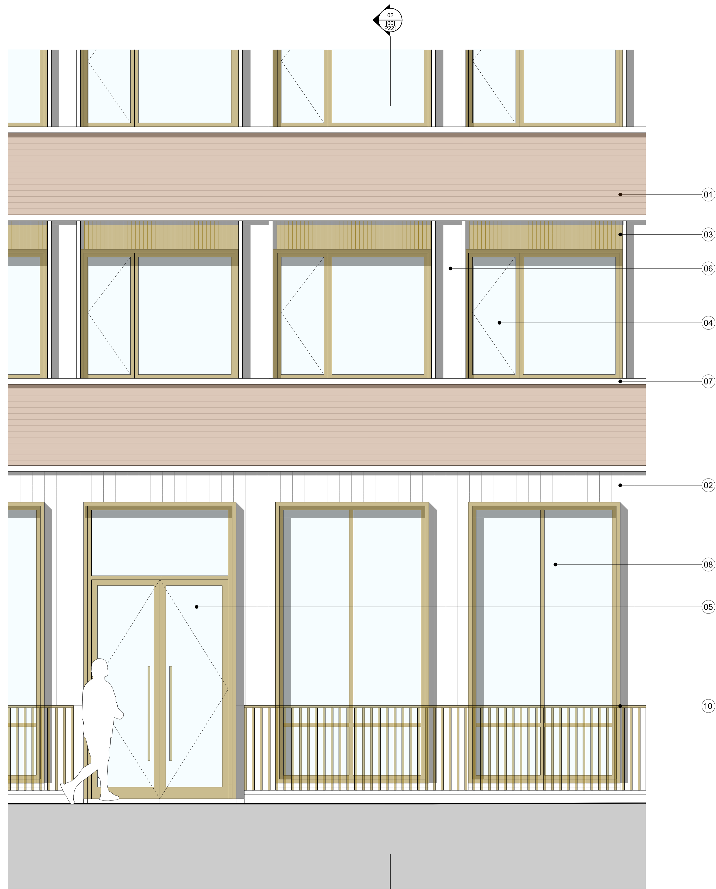
01 BAY ELEVATION: SOUTH ELEVATION LOWER