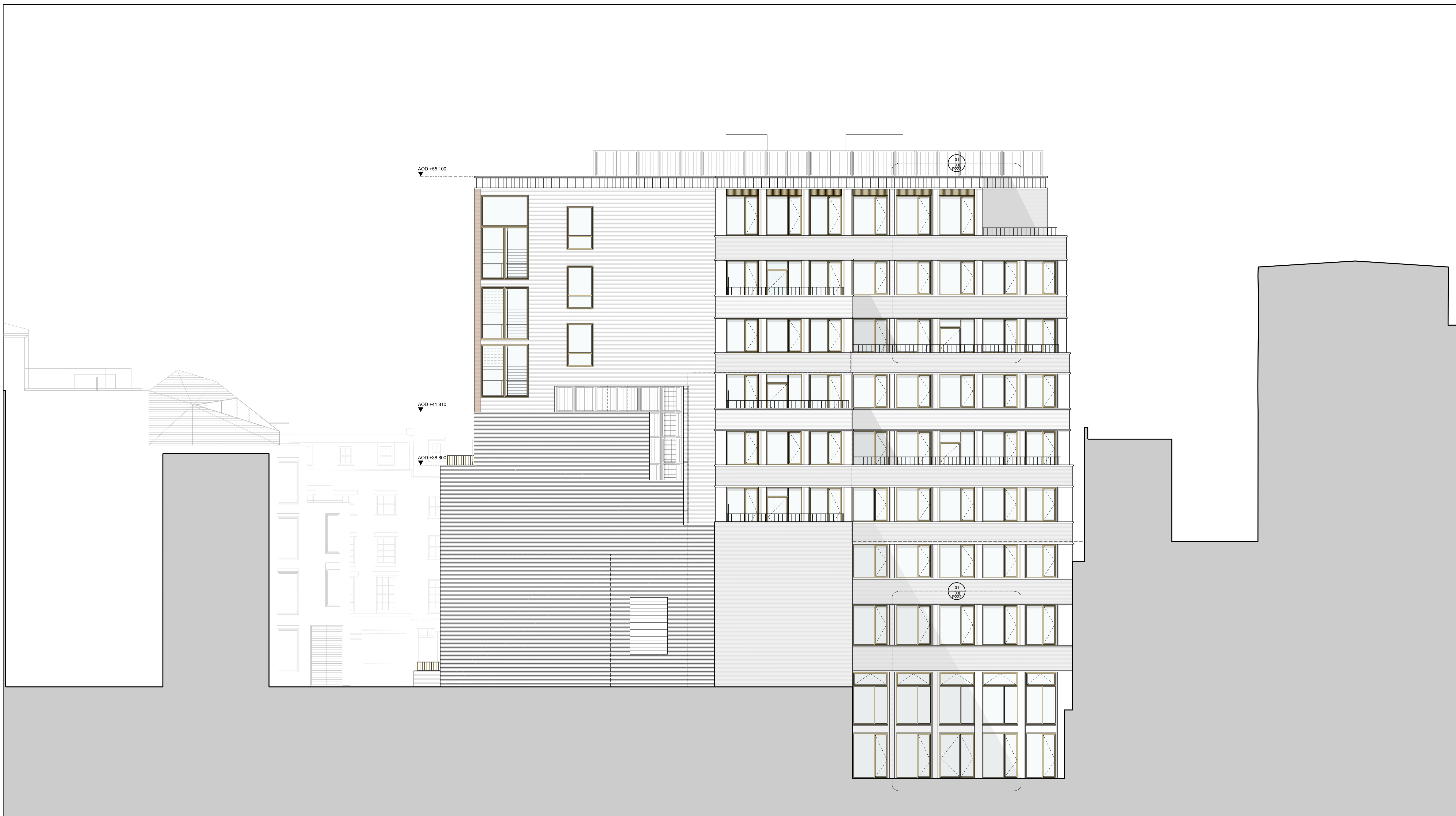
ARTHUR STANLEY HOUSE