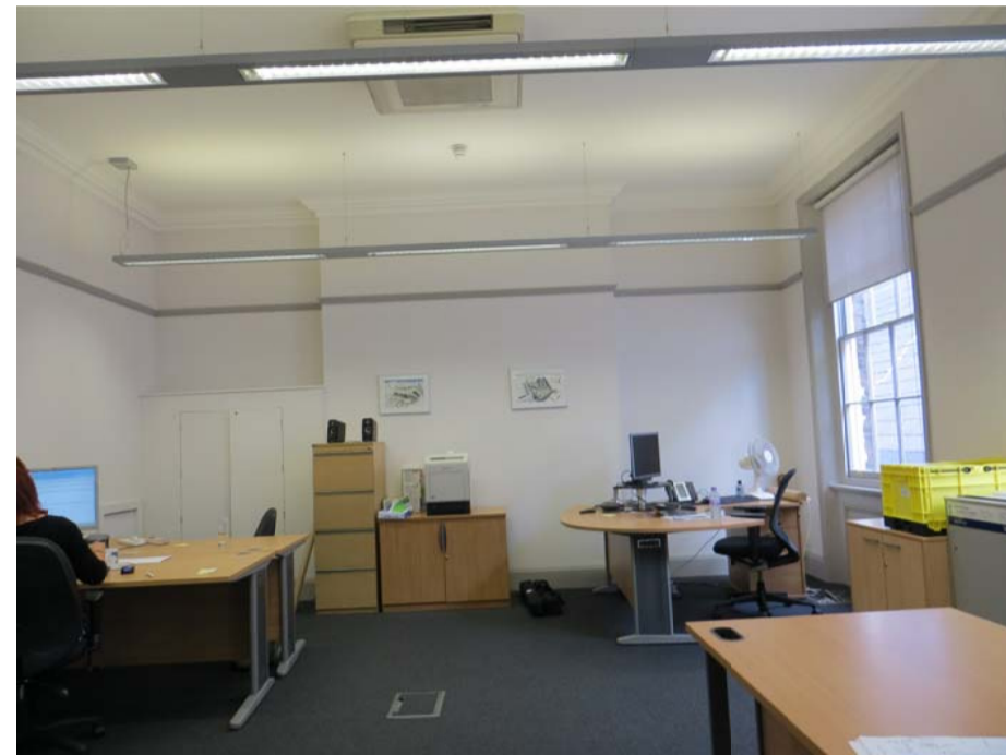
EXISTING DIRECTORS OFFICE