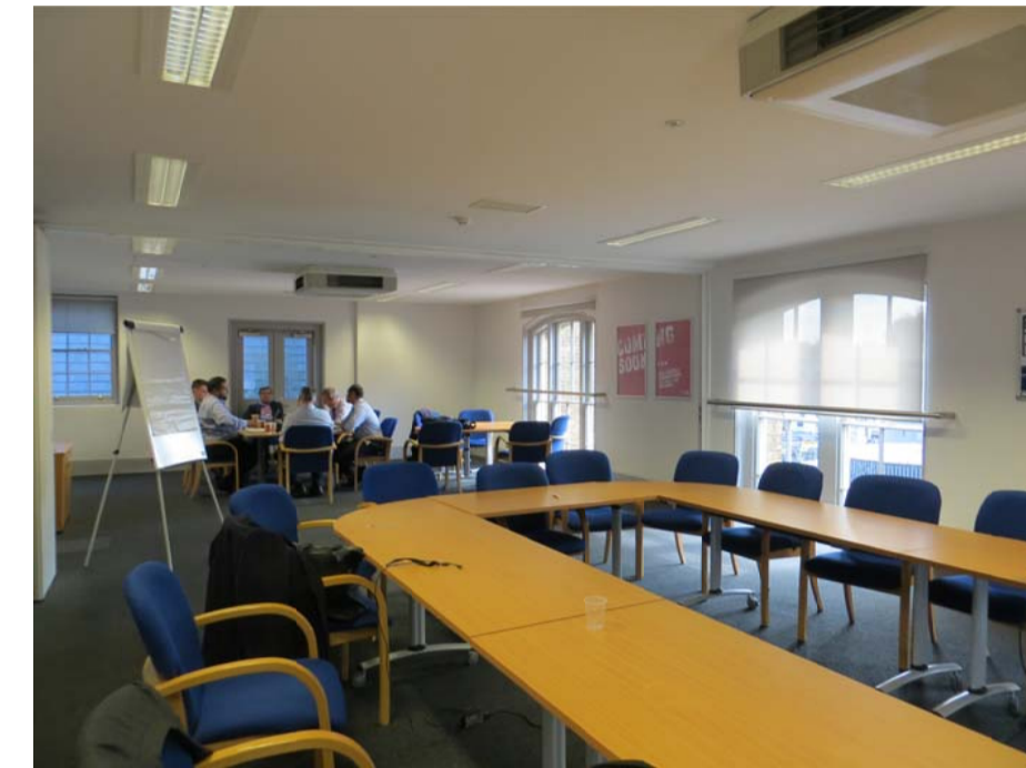
EXISTING BOARD ROOM