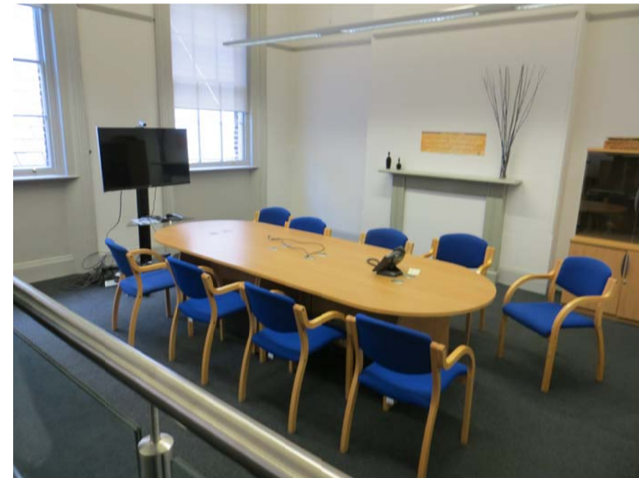
EXISTING DIRECTORS OFFICE MEETING TABLE