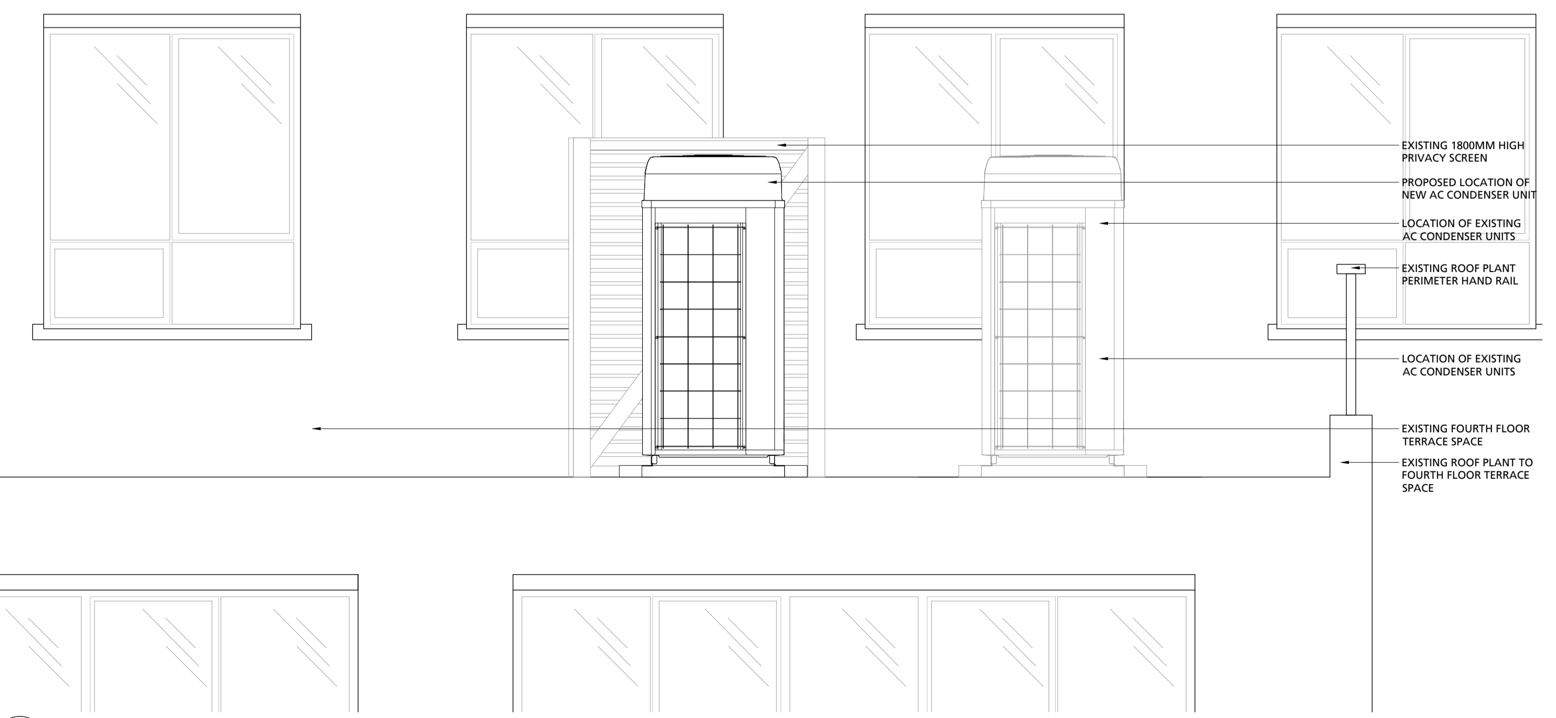
01 FOURTH FLOOR ROOF PLAN - SOUTH ELEVATION 01 SCALE 1:50