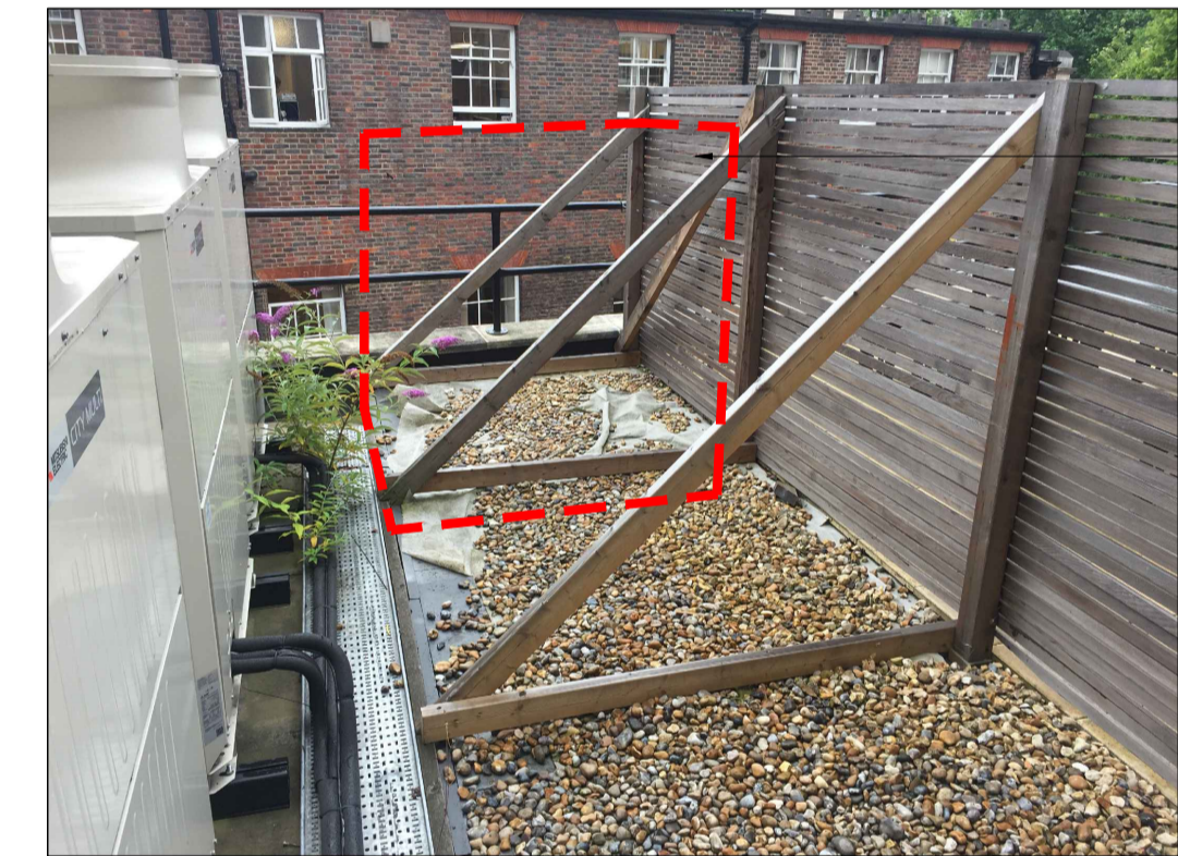
INDICATIVE RED LINE FOR PROPOSED LOCATION OF NEW AC CONDENSER UNIT ALIGNED WITH LAST UNIT POSITION CONDENSER UNIT LOCATION SCALE NTS