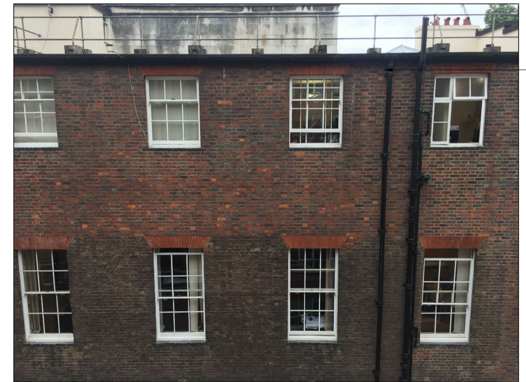
ADJACENT BUILDING ELEVATION BEYOND PLANT ENCLOSURE TO THE SOUTH FOURTH FLOOR ROOF PLAN - ELEVATION VIEW BEYOND SCALE NTS