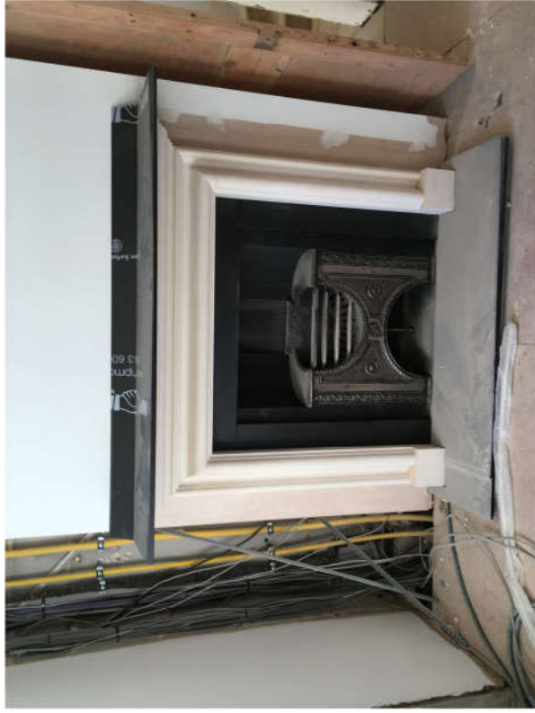
Photograph of Fire Surround