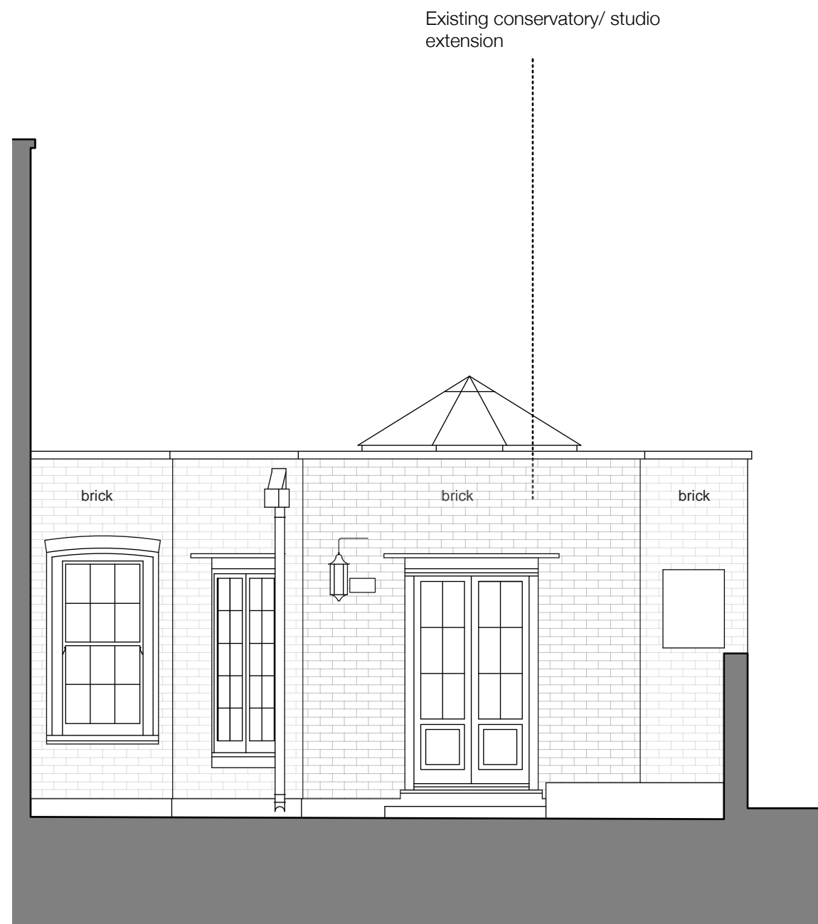
Existing North-West Elevation D (part)