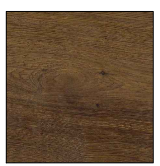
WD0059 Wood Natural Medium Brown