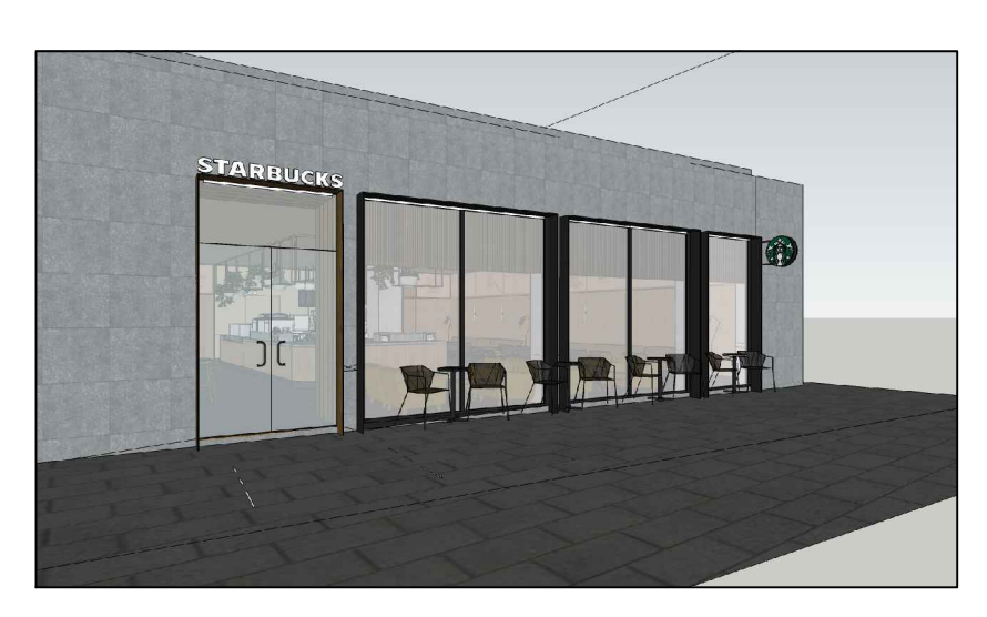
PROPOSED IMAGE (NTS)