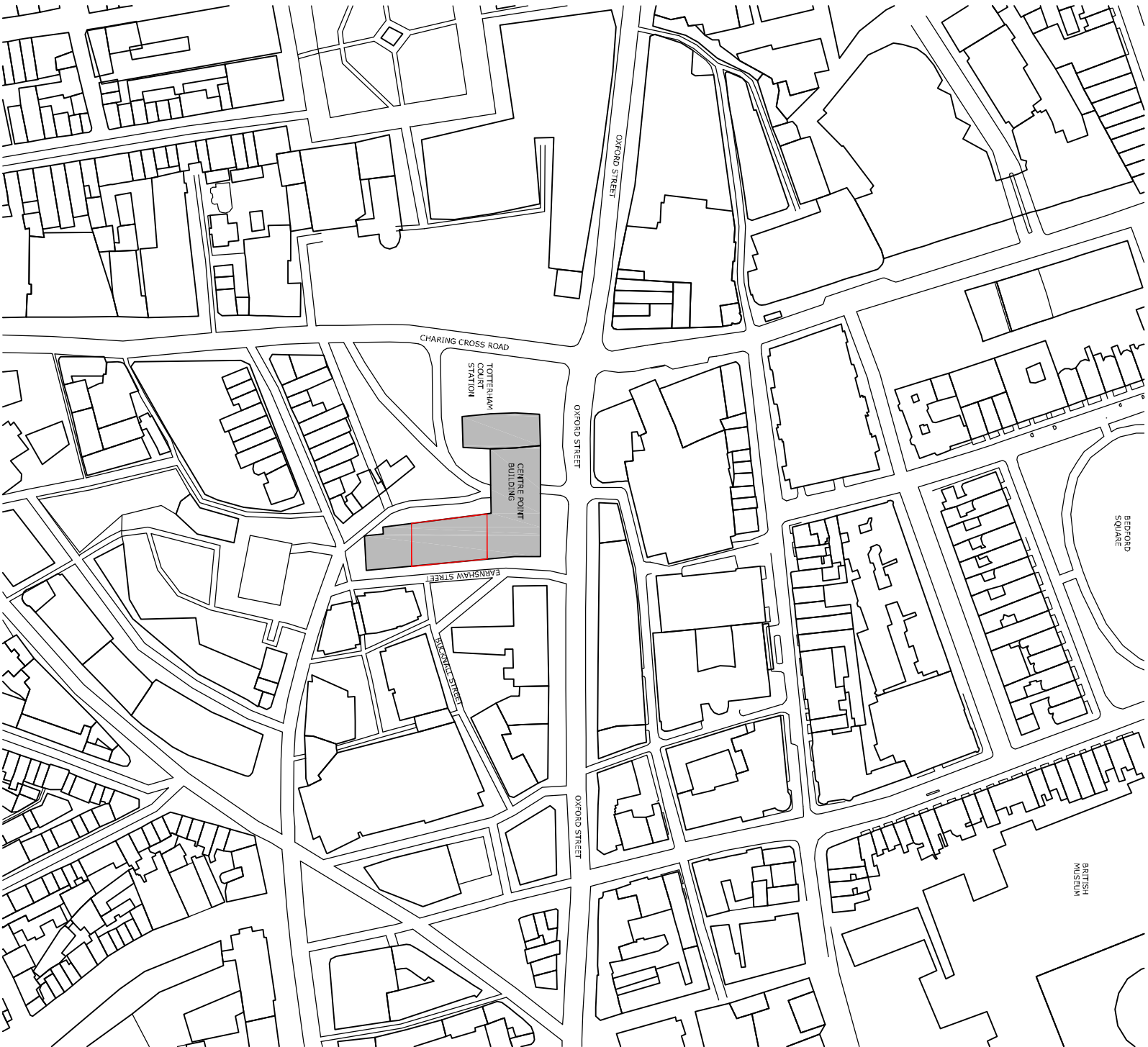
1 LOCATION PLAN 1:1,250 @ A1