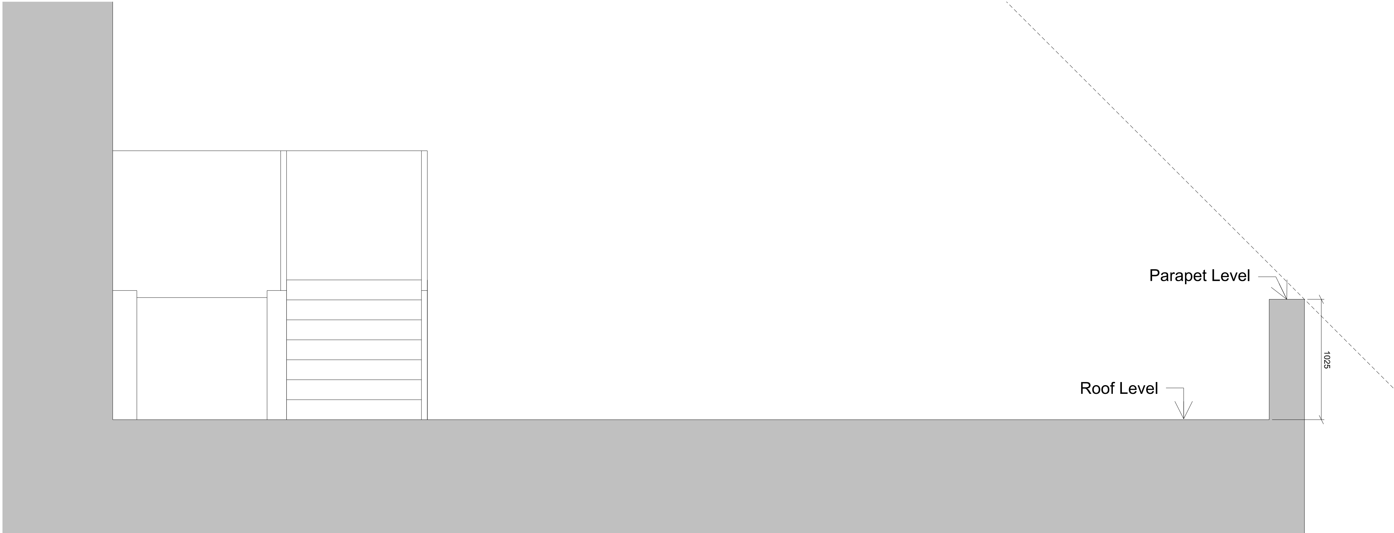
SECTION 01 - EXISTING

TateHindle Limited retain copyright of this drawing. It may not be copied, altered or reproduced in any way without their written authority.