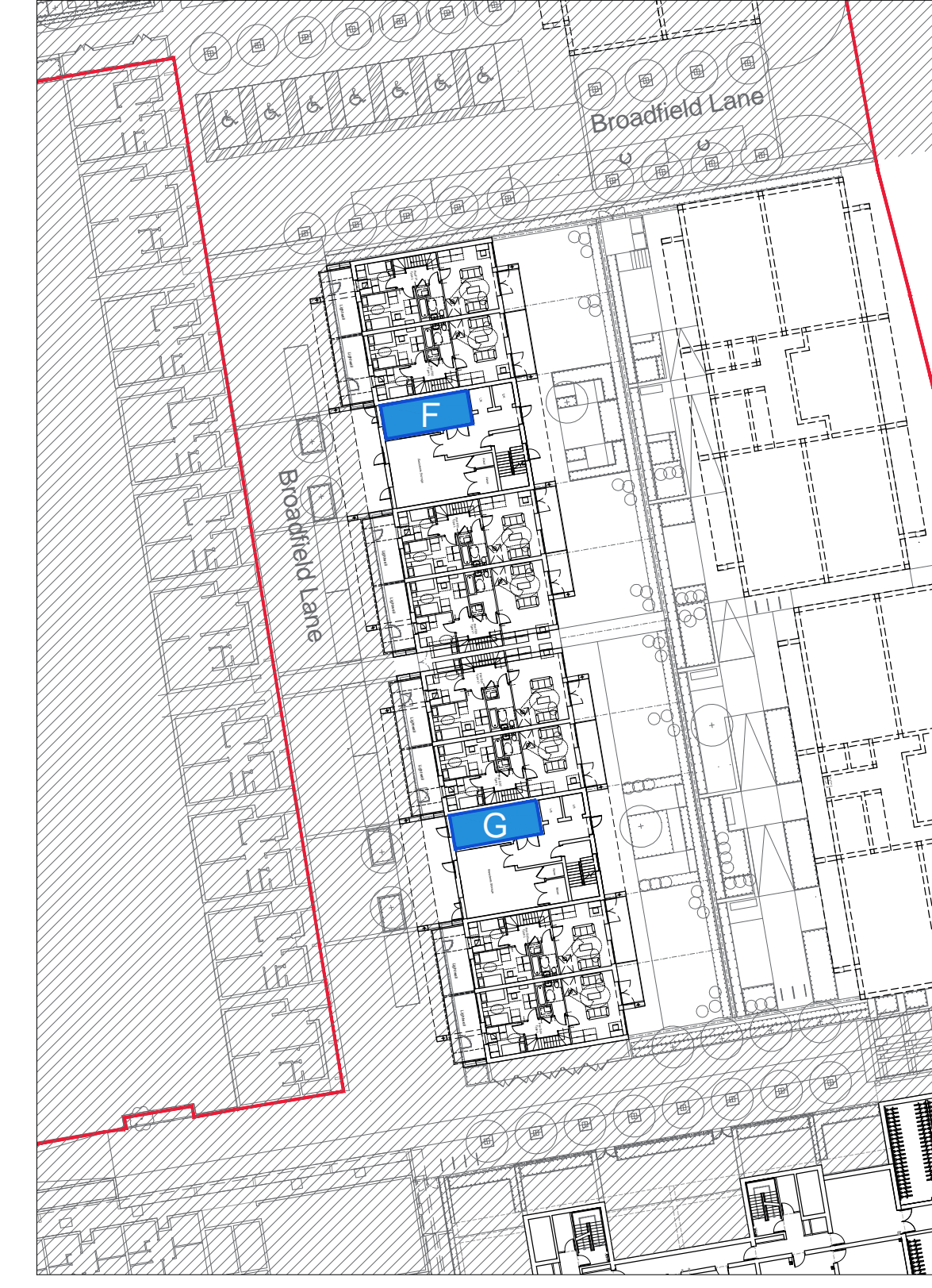
Showing Cycle Storage at Lower Ground Level