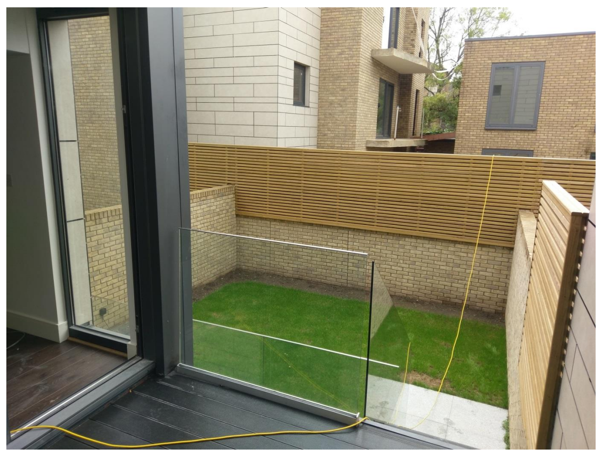
Photo.2 View from site of proposed extension looking down into garden