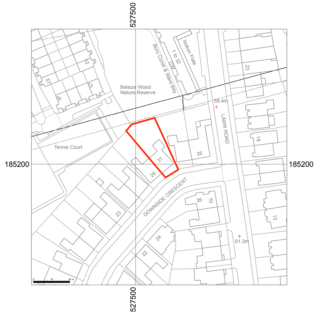
1 LOCATION/OS PLAN 1:1250