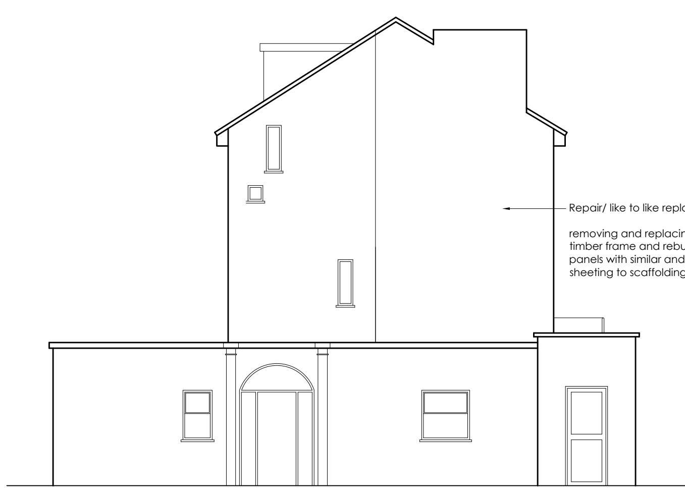
SIDE ELEVATION PILGRIM LANES