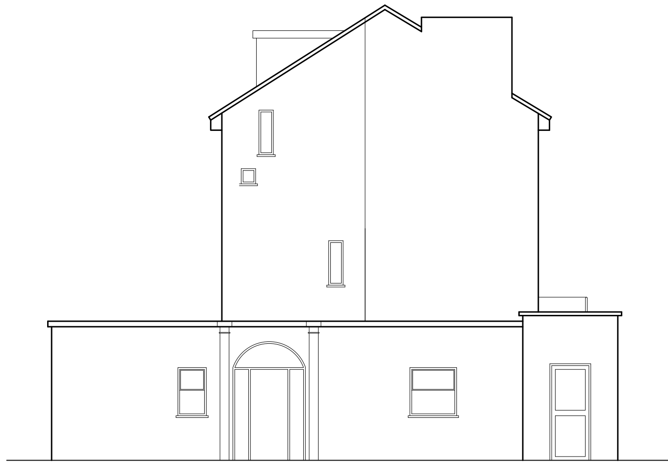
SIDE ELEVATION PILGRIM LANES