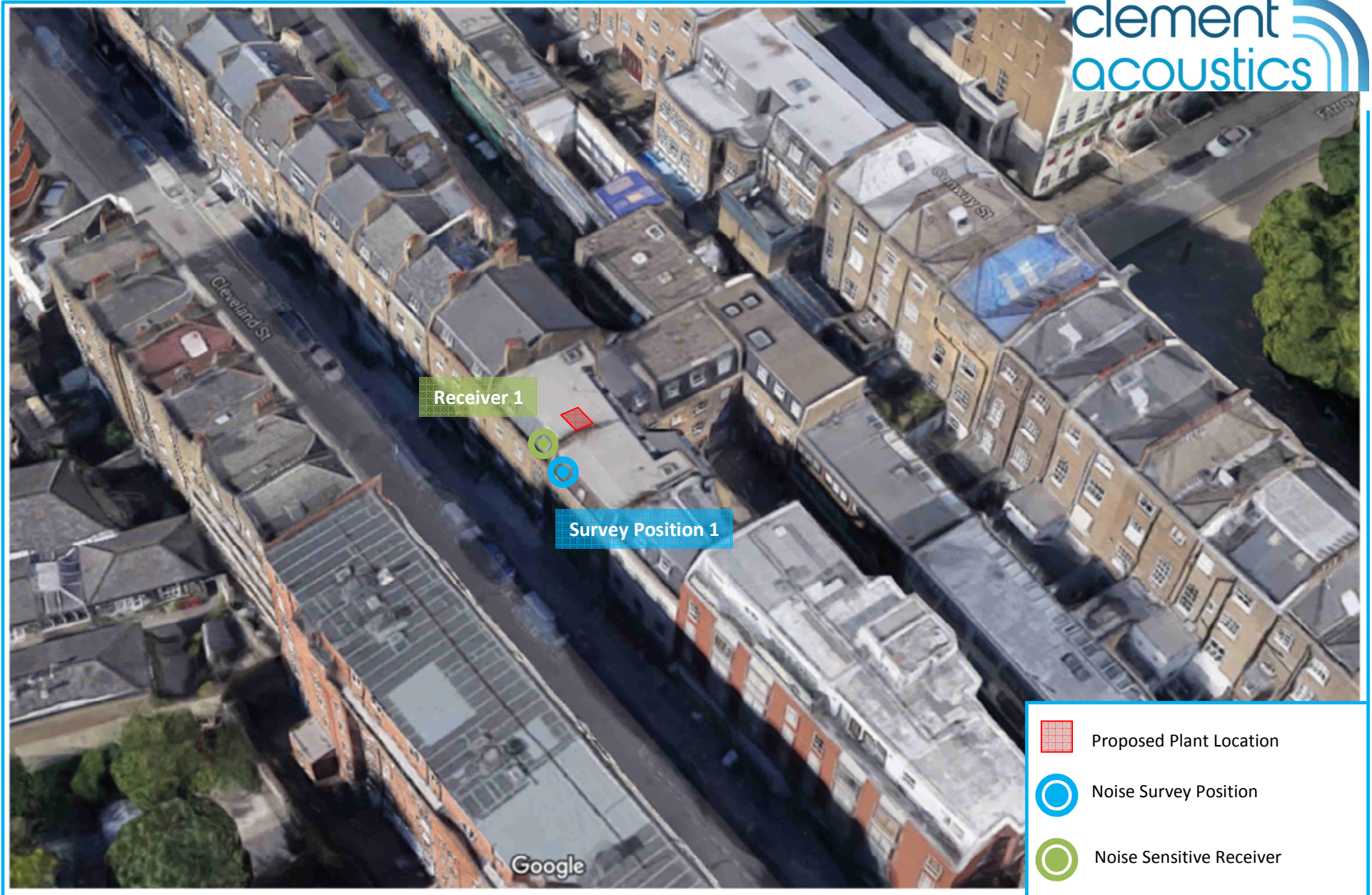
12677-SP1 Indicative site plan indicating noise monitoring position and nearest noise sensitive receiver