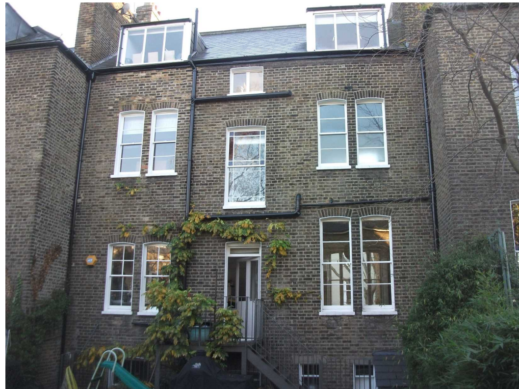
View of rear elevation