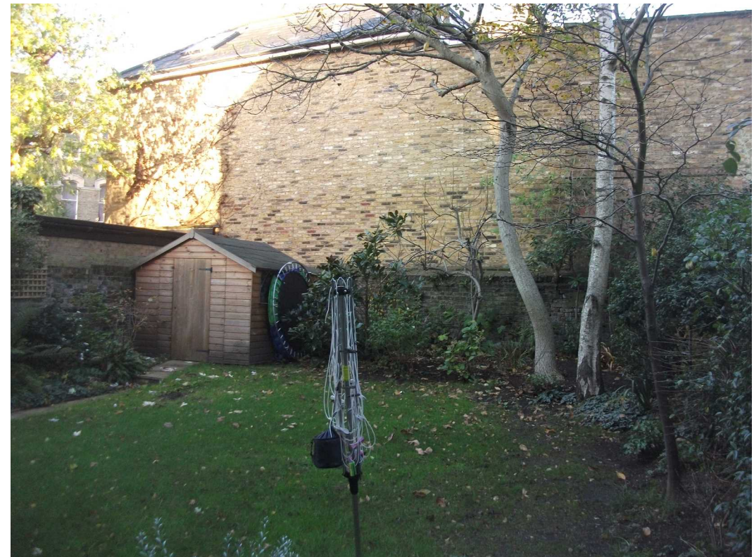
View of rear garden