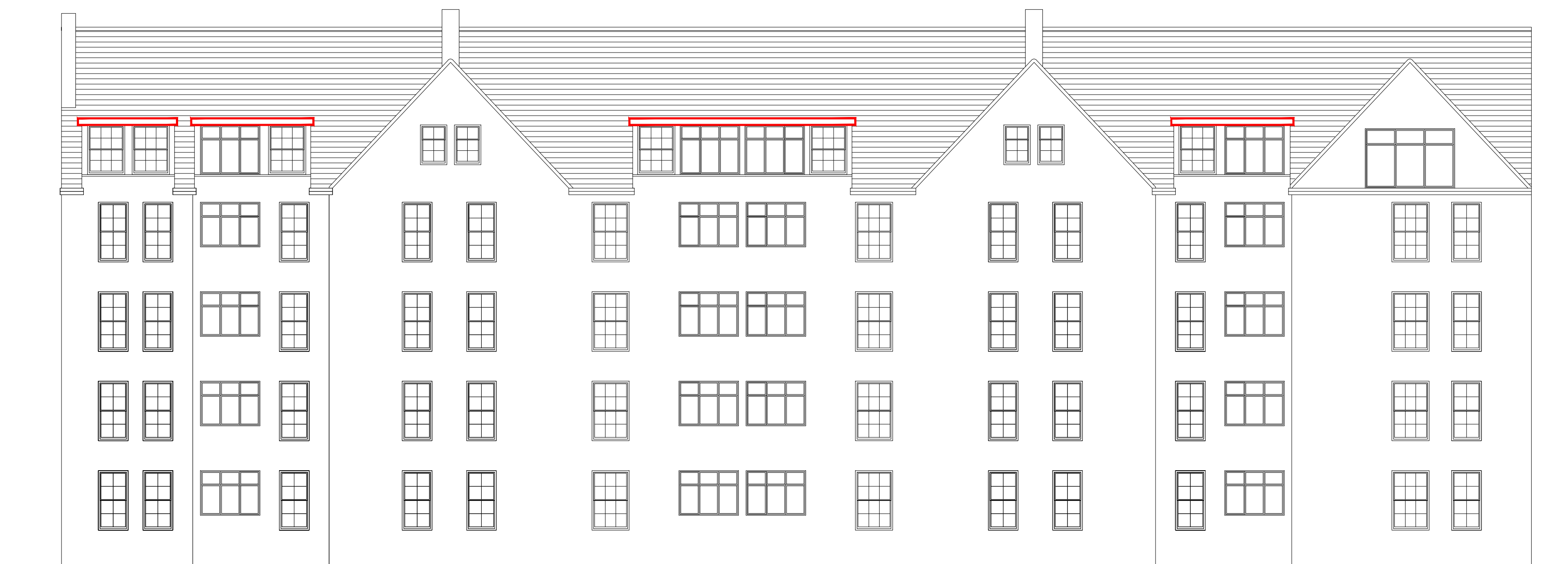
Coram House - Rear Elevation