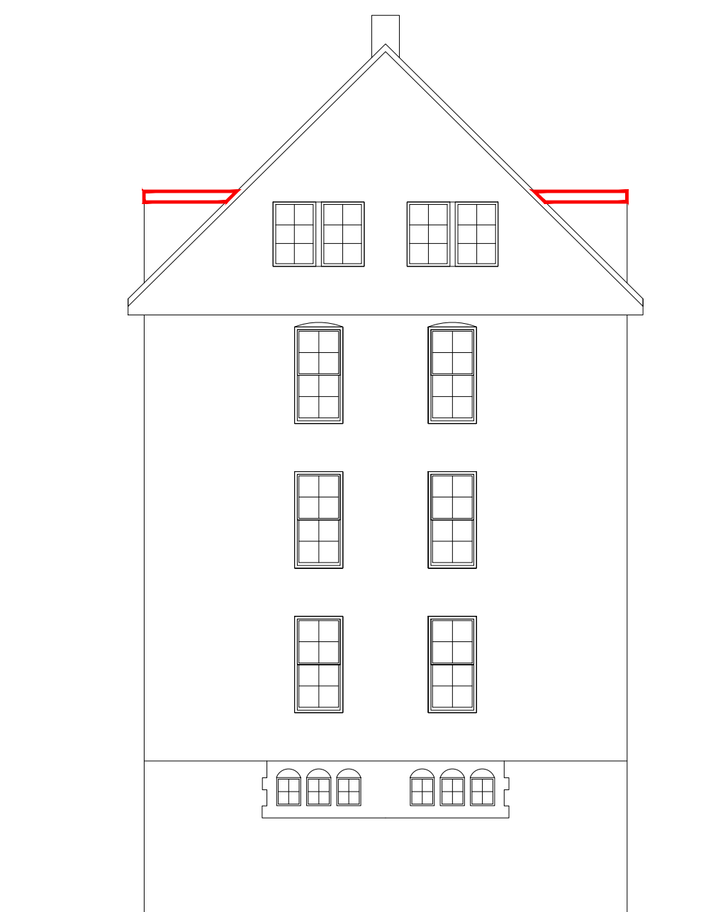
Coram House - Side Elevation

Existing dormer roof covering to be replaced with new roof covering and thermal upgrade. Refer to drawing CD/C358-AD-05