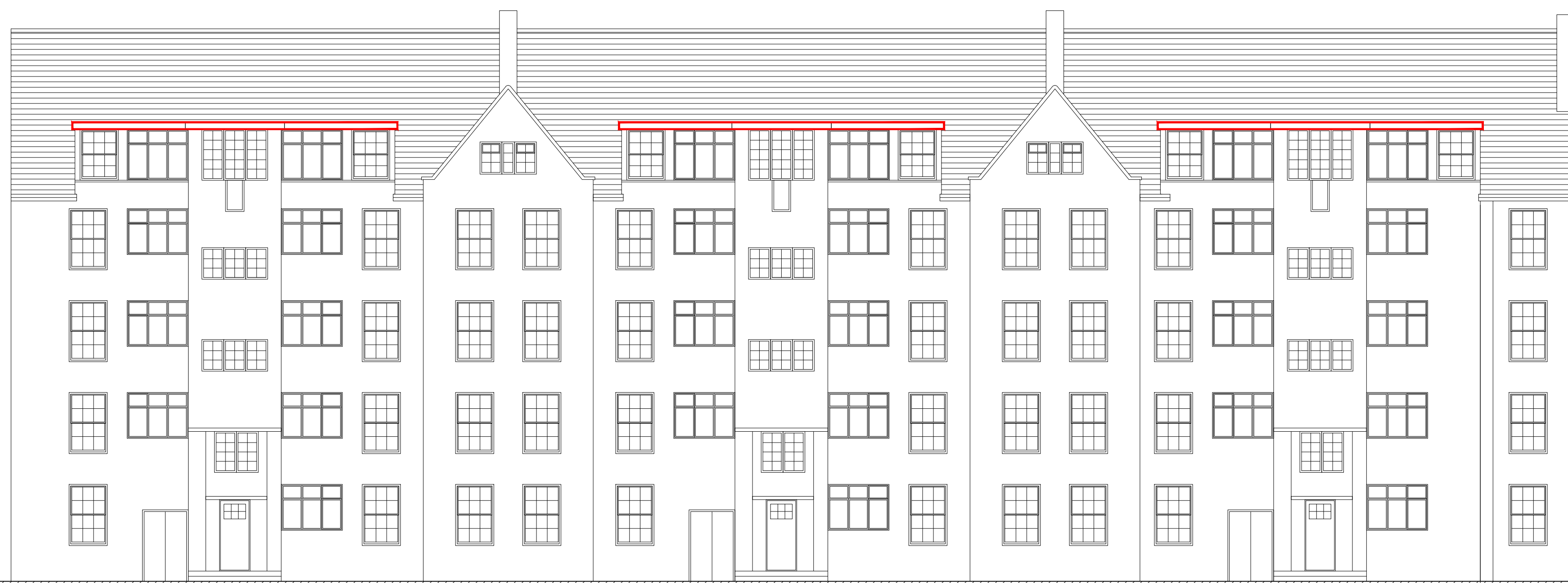
Coram House - Front Elevation