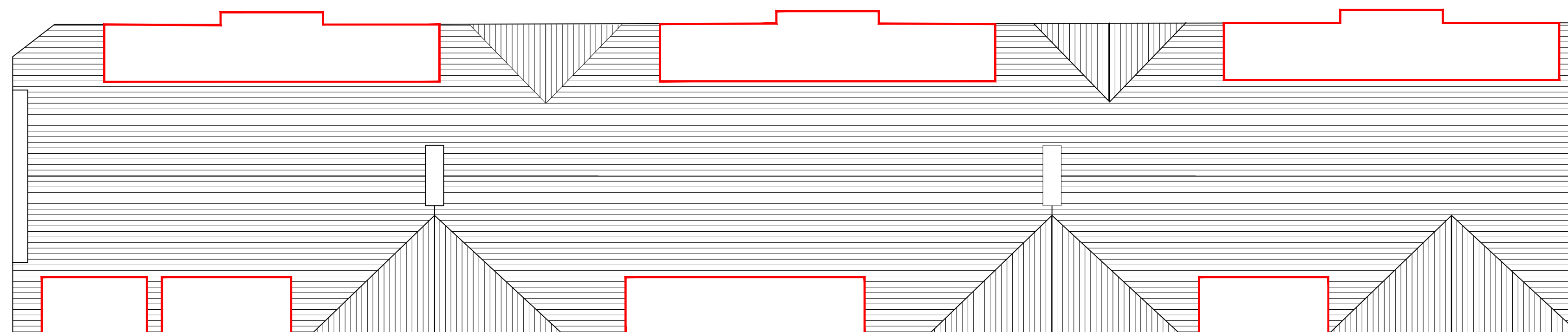
Coram House - Proposed Roof Plan