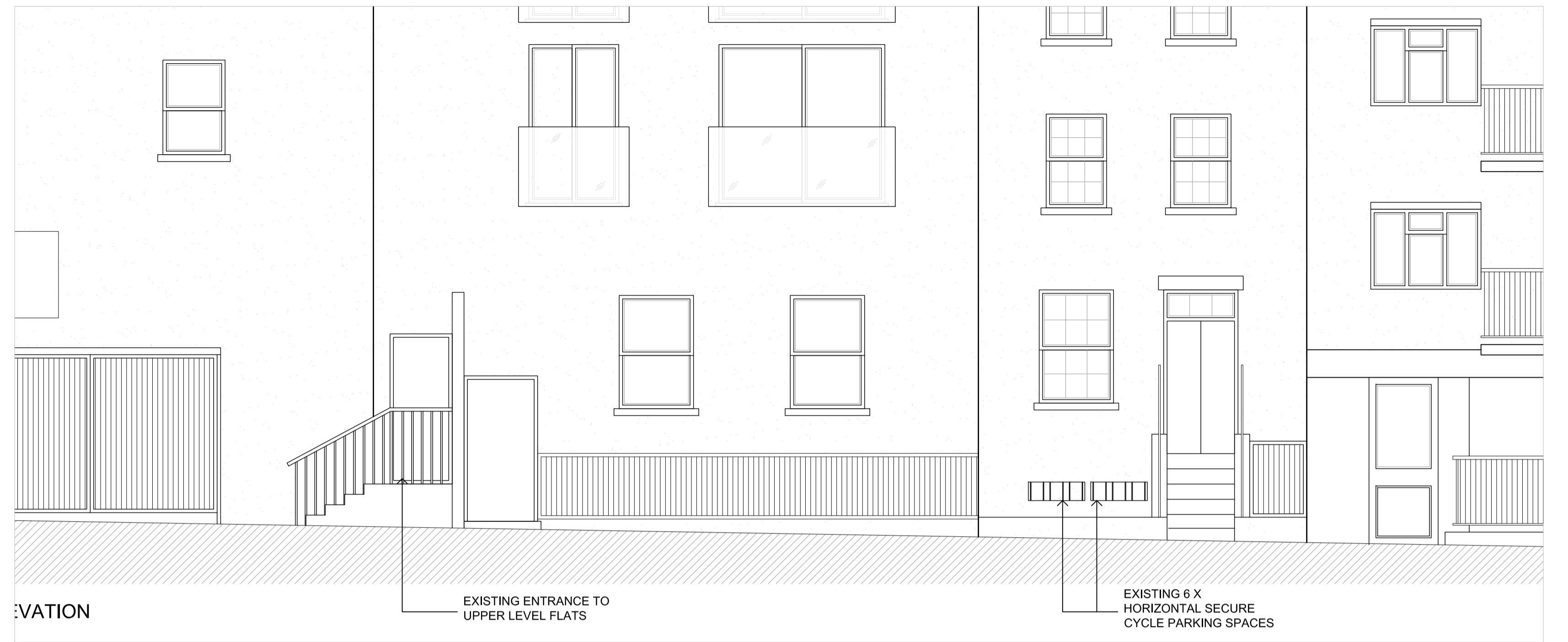
EXISTING ELEVATION - CYCLE PARKING SCALE 1:50