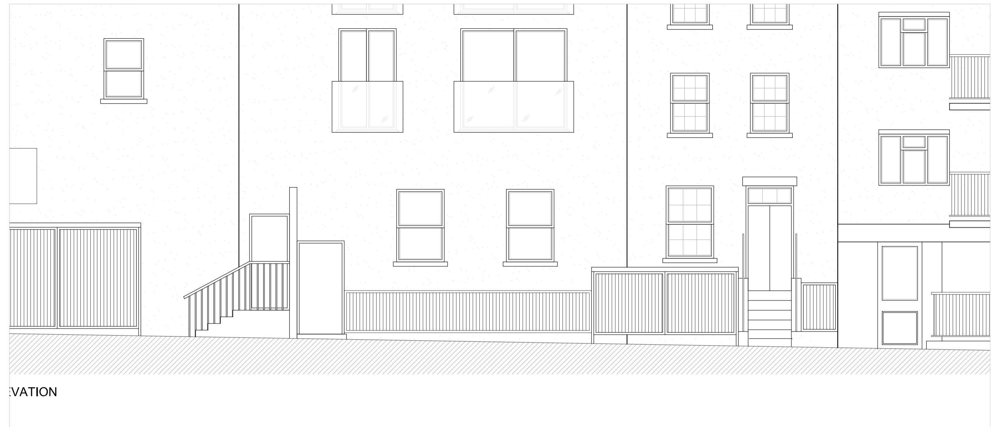
PREVIOUSLY APPROVED ELEVATION - CYCLE PARKING SCALE 1:50