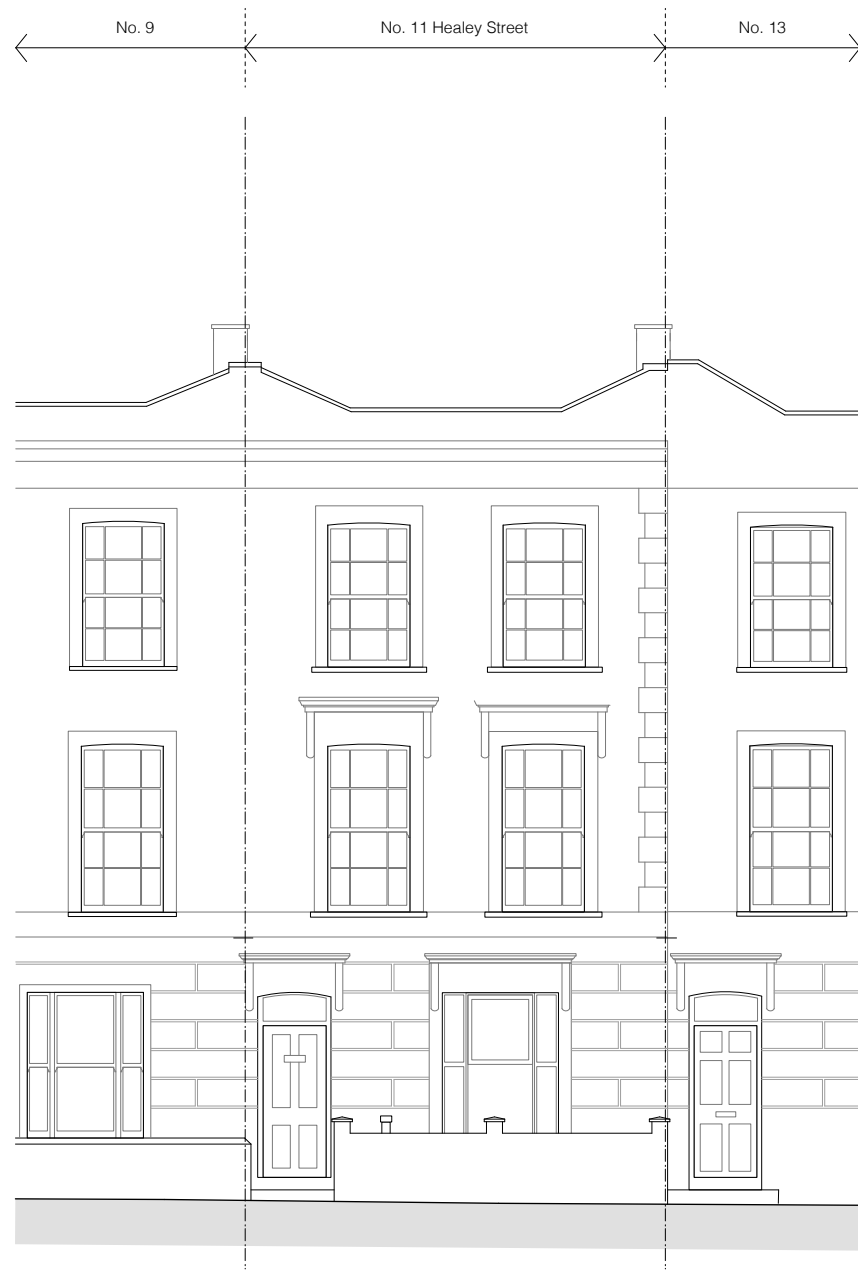
FRONT ELEVATION: EXISTING