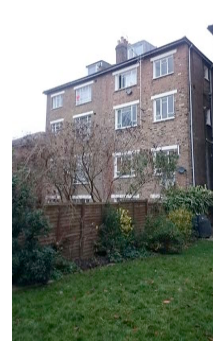
view to no. 4