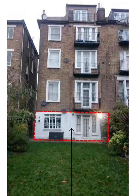
location of proposed rear extension