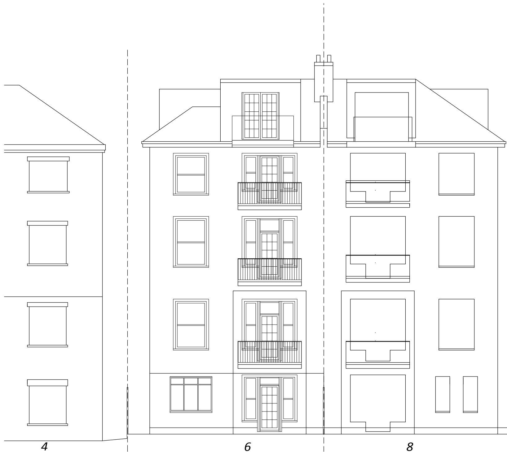
EXISTING REAR ELEVATION (SOUTH EAST)