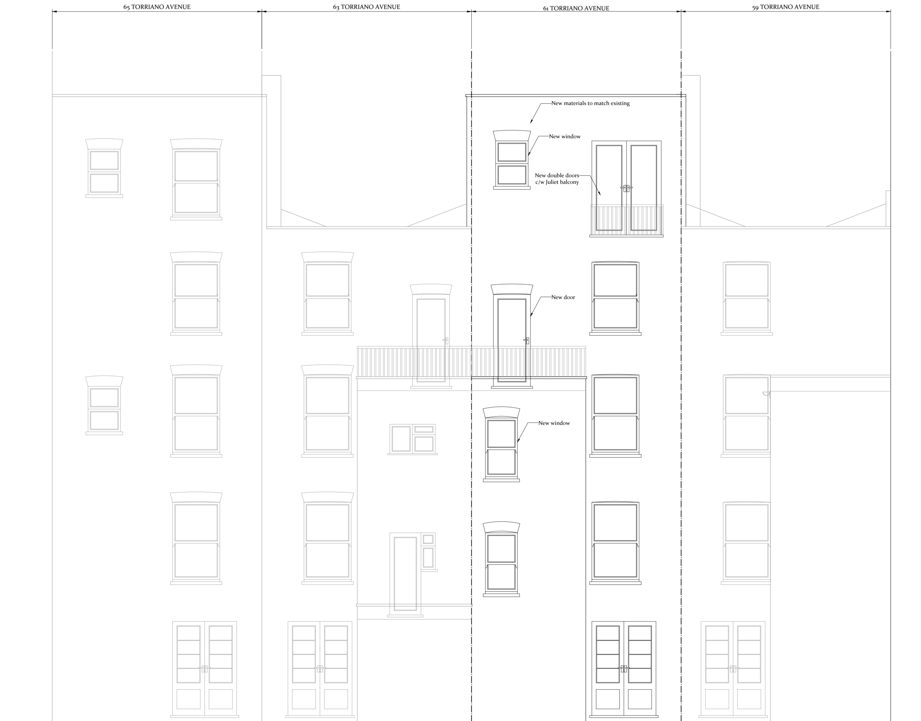
ST 18 PROPOSED REAR ELEVATION 01 SCALE 1:50 @ A1