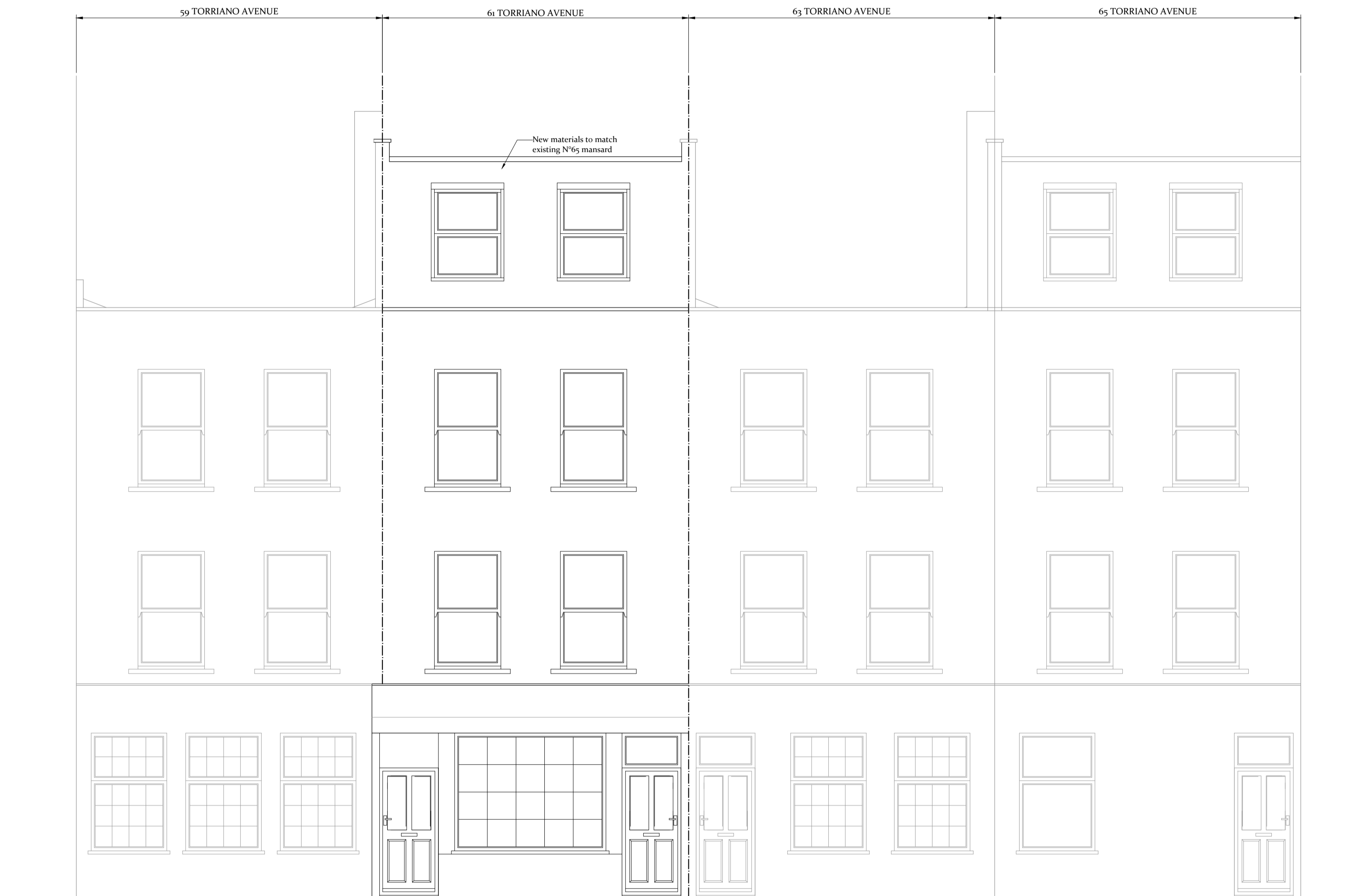
ST 17 PROPOSED FRONT ELEVATION 01 SCALE 1:50 @ A1