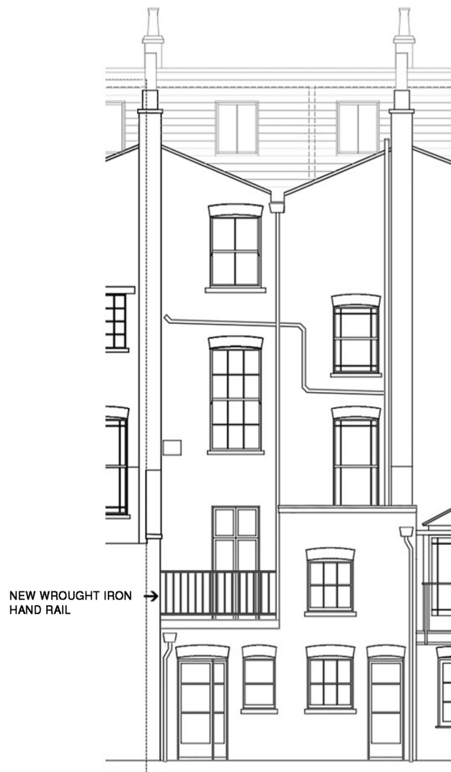
REAR ELEVATION - PROPOSED