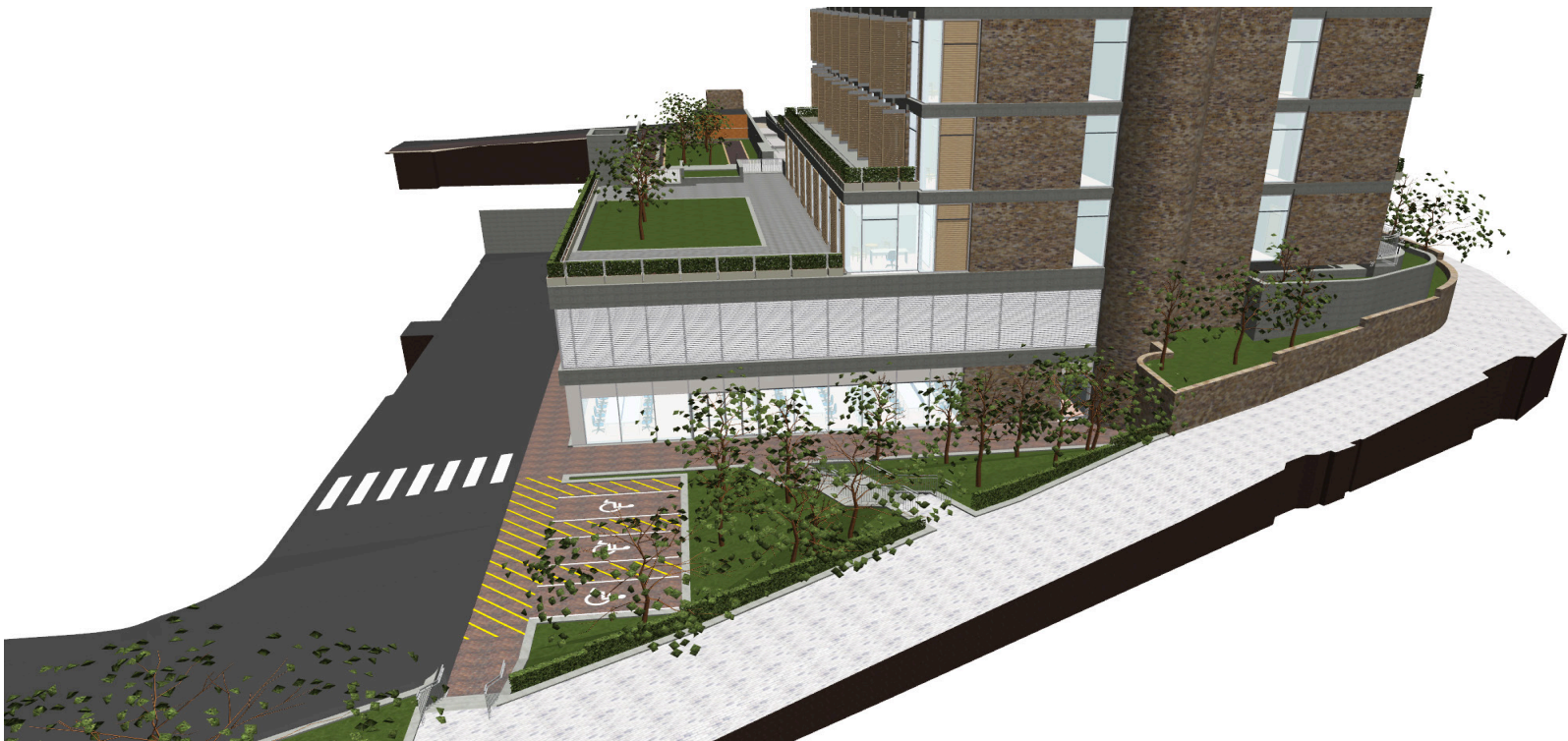
Fig 9: Proposed amendment: layered approach to terraces retained

The proposed amendment retains the preferred terraced arrangement, which is deemed a more comfortable way to deal with the landscape when compared to the options of a ‘bank’ or ‘a wall’. In addition the layering of the landscape reflects the layering of the building. The only change from the consented scheme proposal for the external terraces is the proposed reduction in the terraces’ width, in order to accommodate the existing footprint of the public footpath as closely as possible.