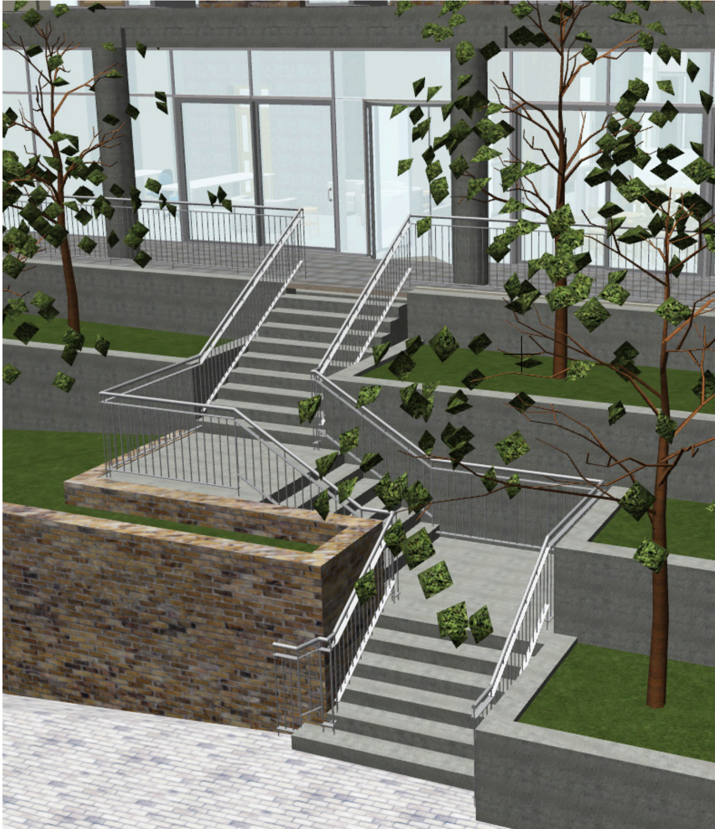
Fig 2.6 (3) Shape of main entrance stair revised to accommodate the reduced width of the landscape.