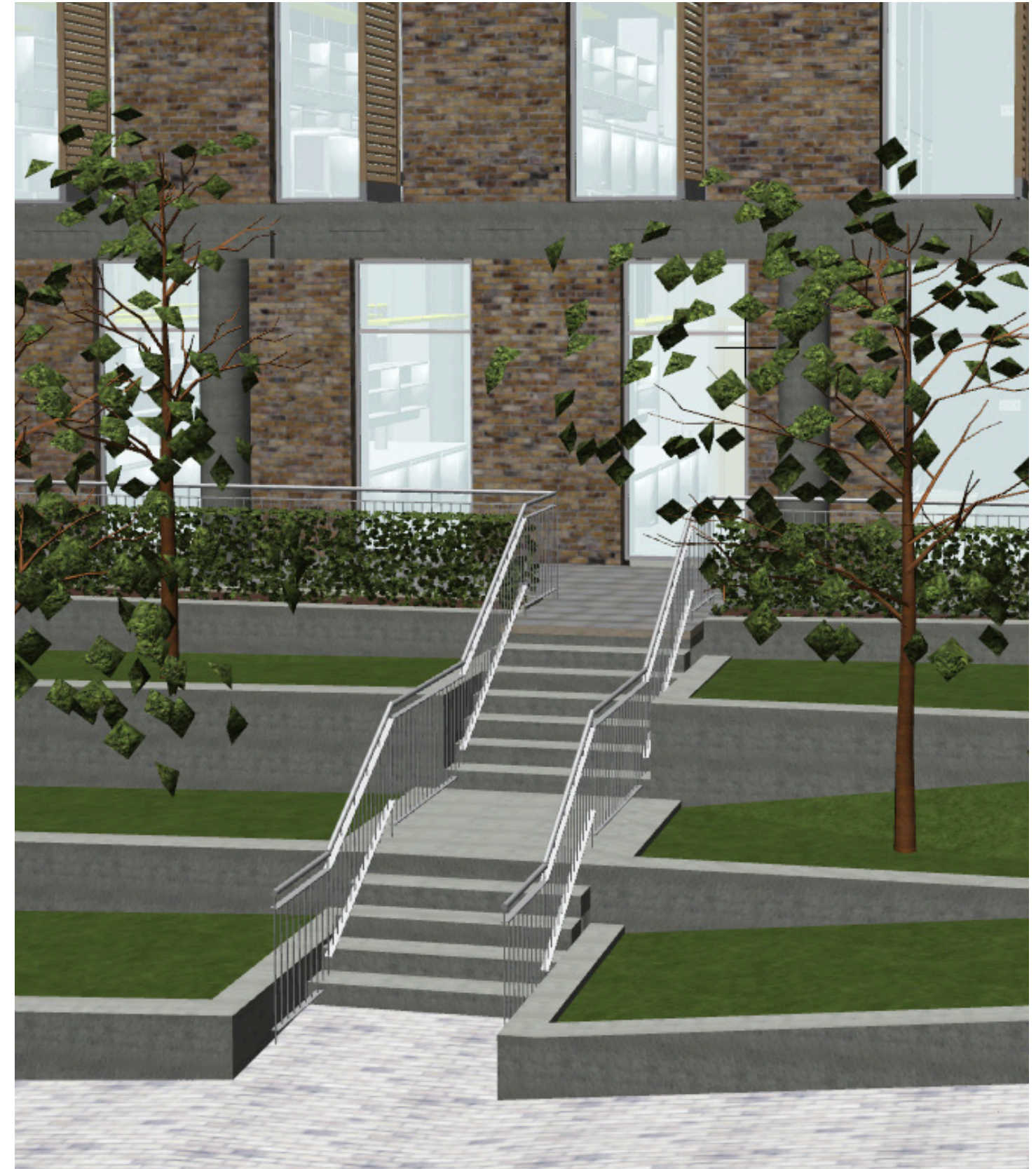
Fig 2.5 (2) Stair pushed back / side walls removed