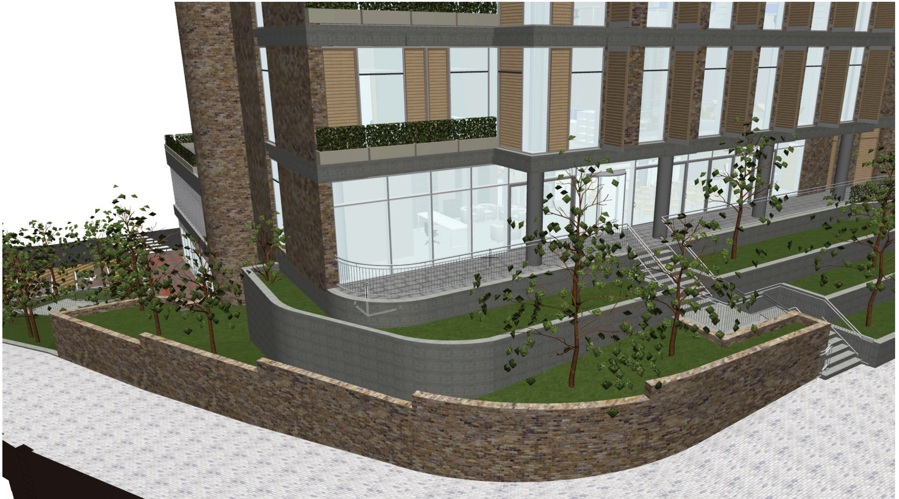
Fig 2.8 (4) North-West corner revised