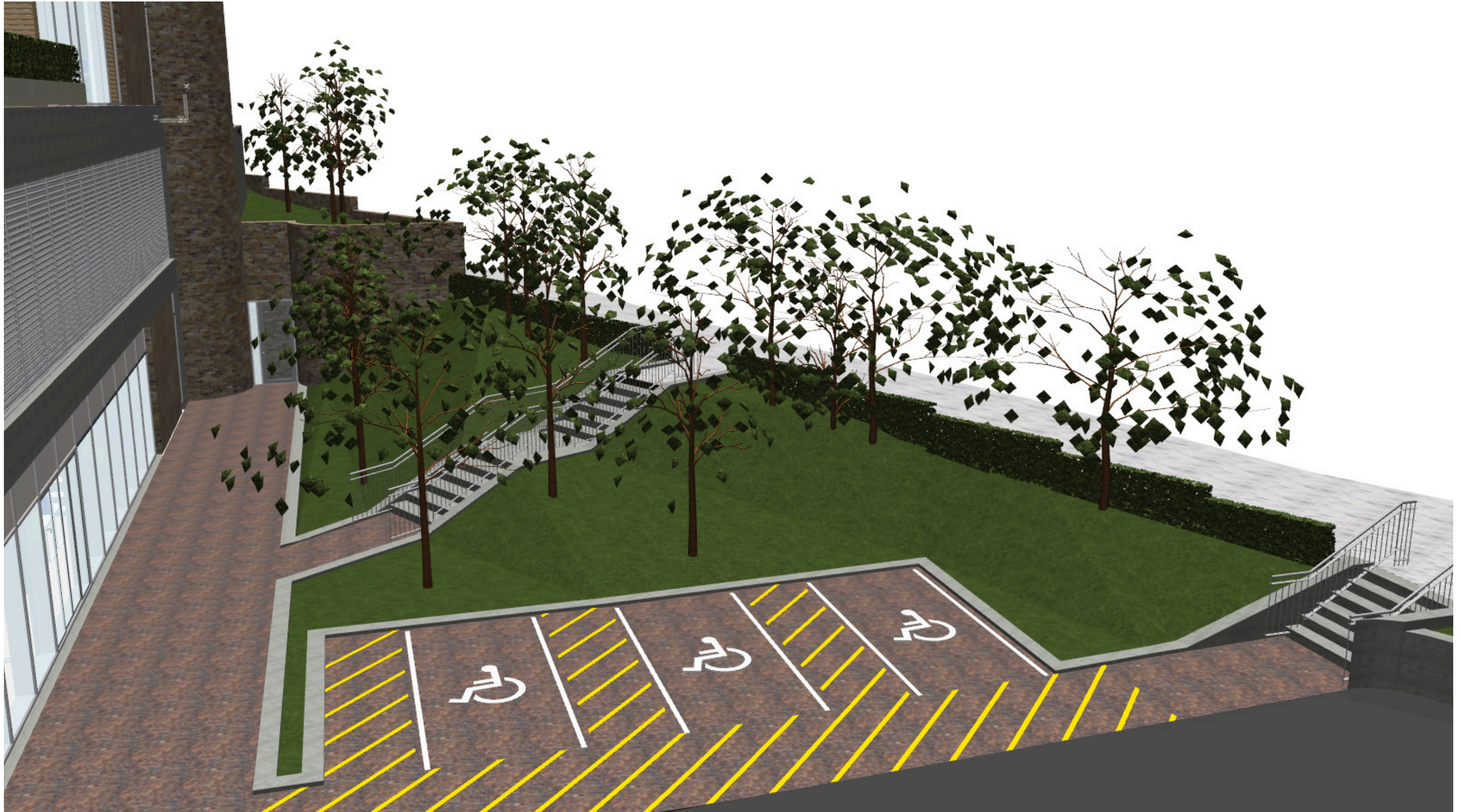
Fig 2.9 (5) Staircase / Landscape and courtyard reconfigured / 6) Staircase moved (7) One additional disabled car park space added