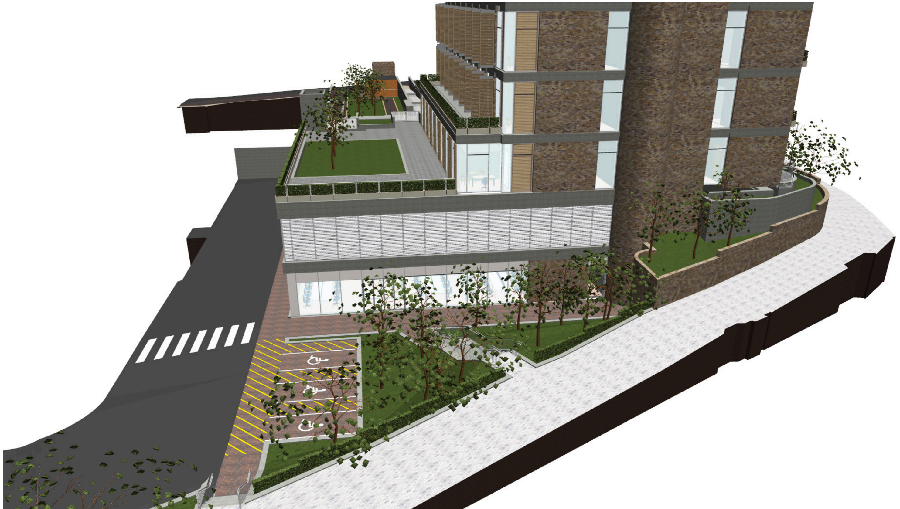
Fig 2.2 Aerial View from the North-West