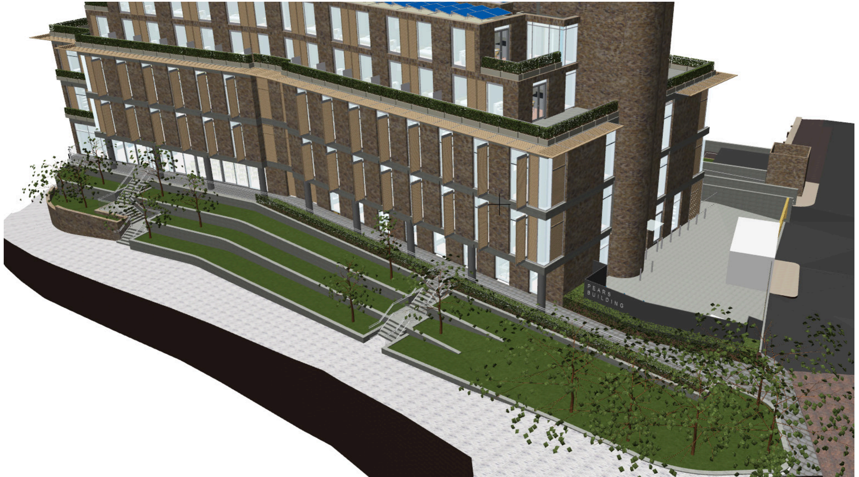
Fig 2.3 Aerial View from the South-West