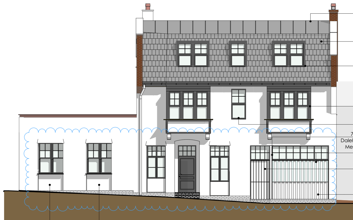
E2 1:100 Proposed West Elevation