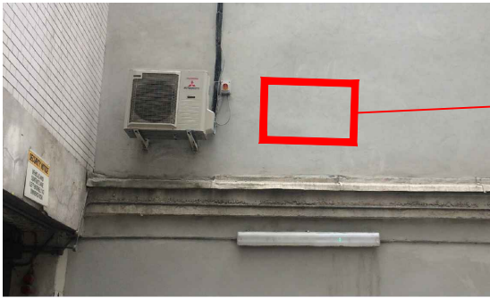
NEW CONDENSER (MUZ-FB50VAH) PROPOSED LOCATION