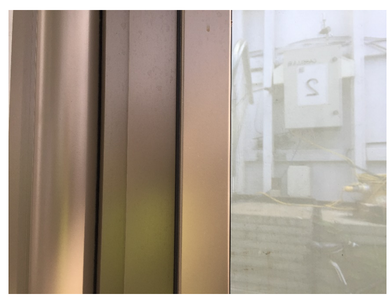
Detail: Door frame