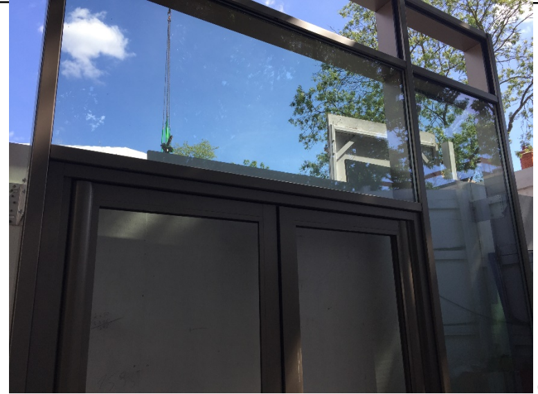
Close-up: Over-/ side-panel/ door