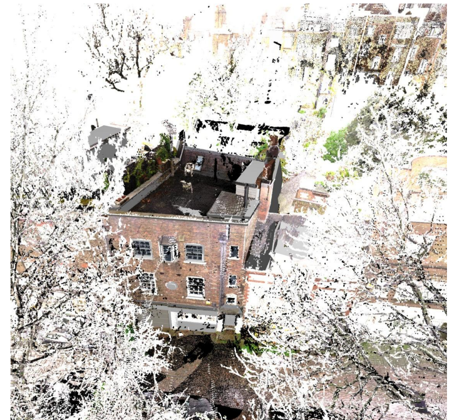
view- top roof - PC