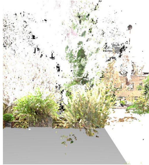
View From 24 Church Row - PC