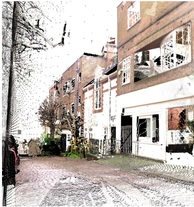
View of maximum visibility -PC