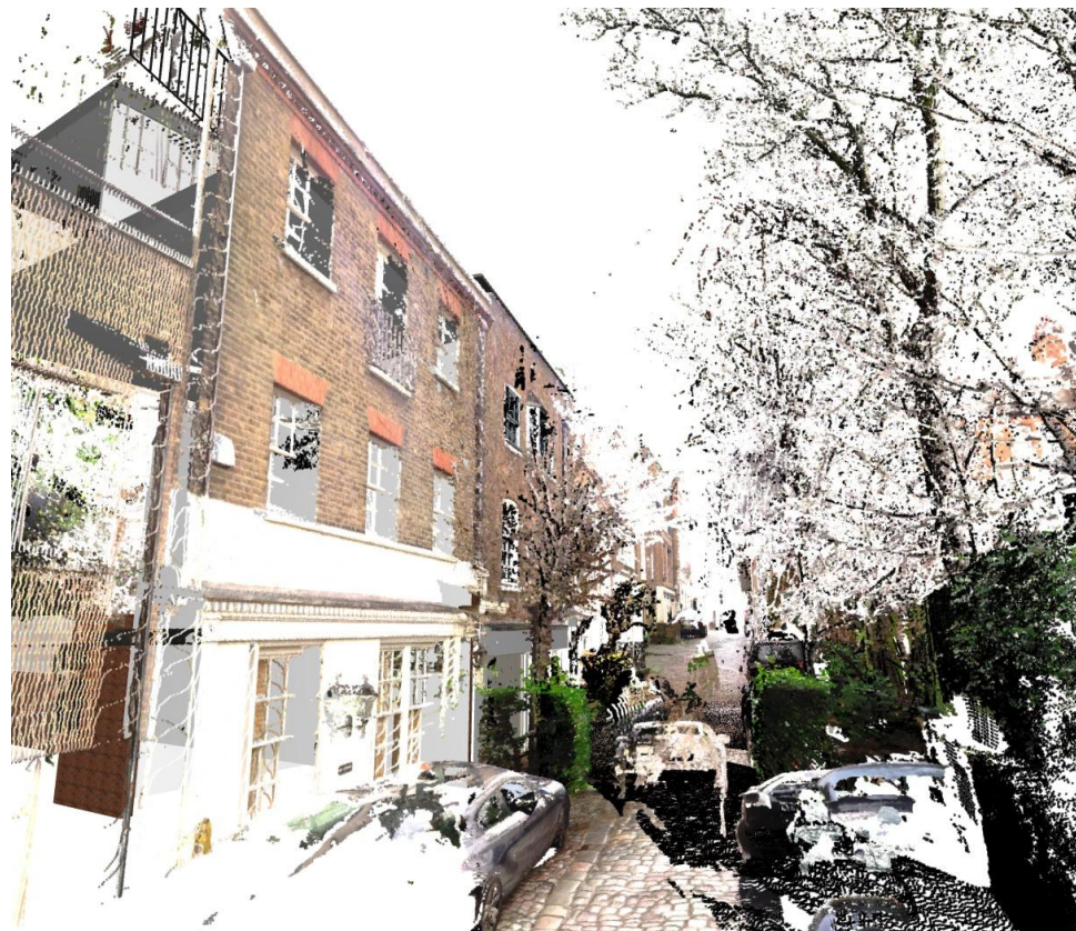
View from bottom of the street -PC