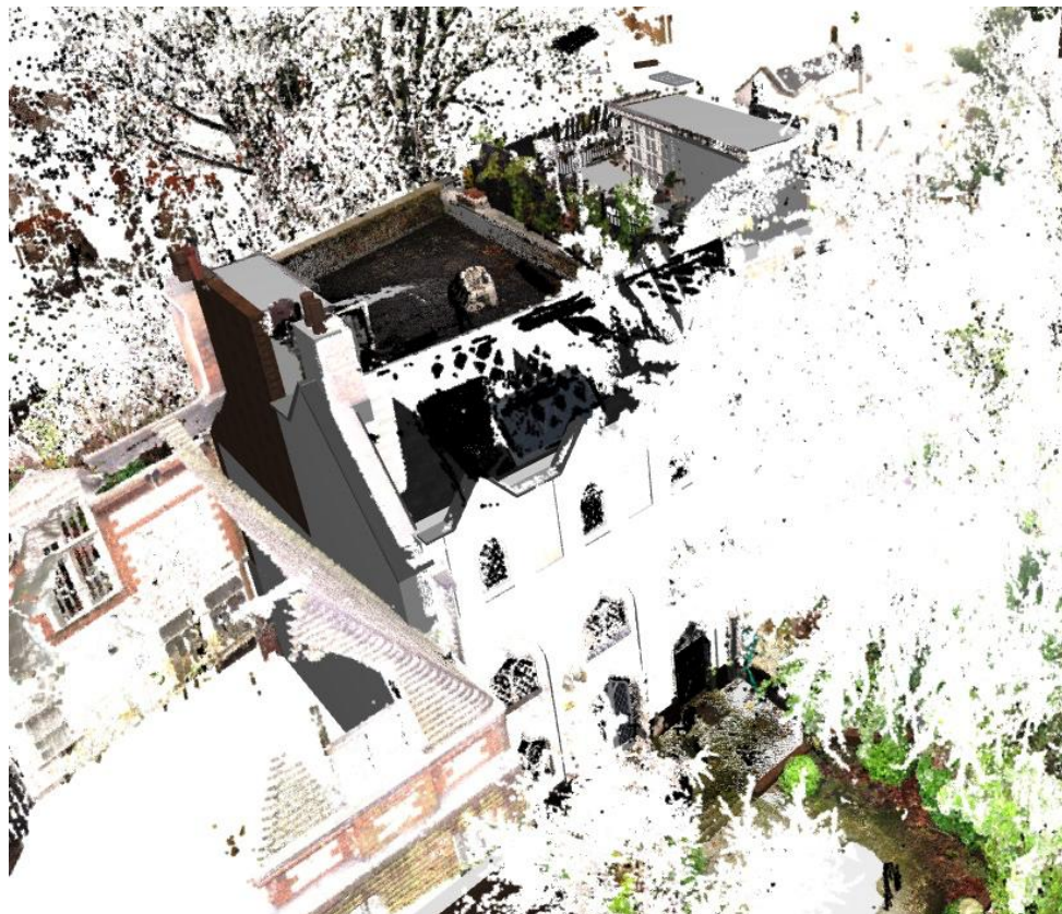
View - birds eye view existing PC