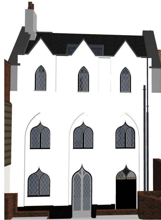
Closer view from rear Existing (No Point Cloud/foliage for clarity of model)