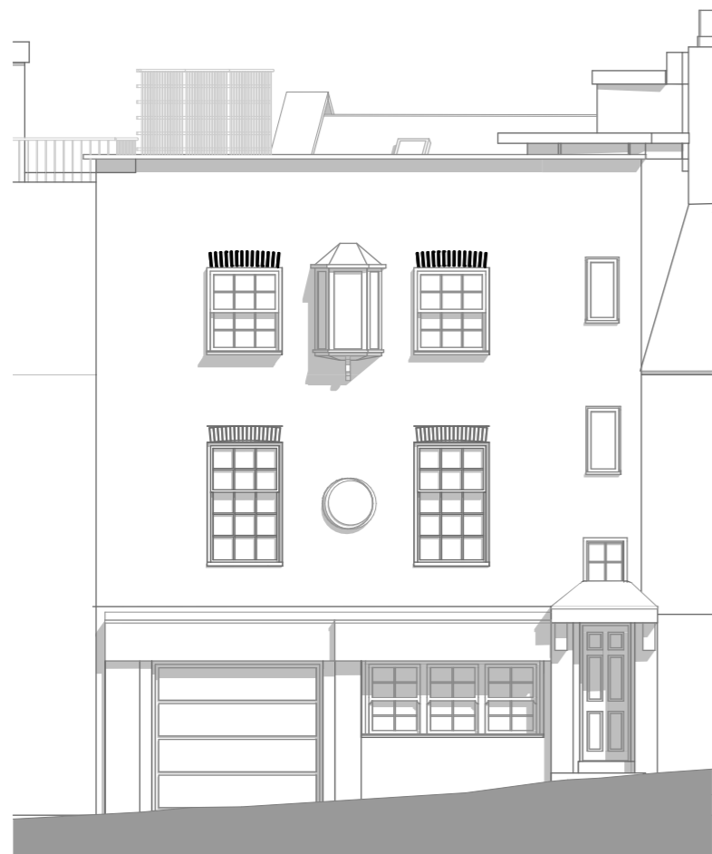
E-04 True Front Elevation 1:100