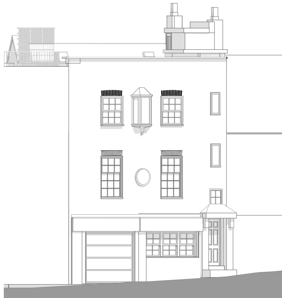
E-01 Front Elevation 1:100