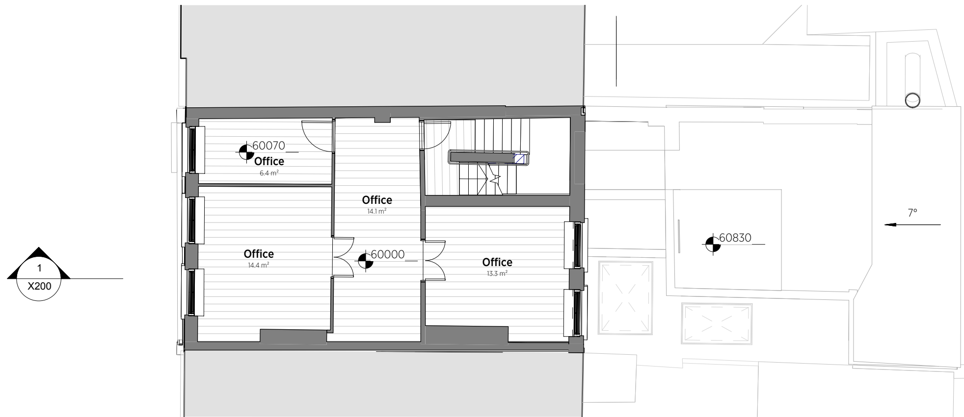
2 Existing 3rd Floor 1:100 @ A3