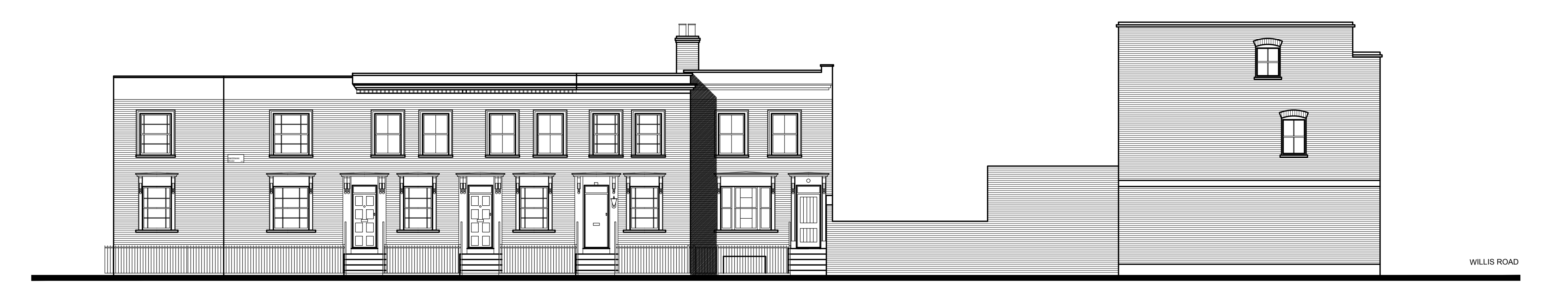
EXISTING ELEVATION TO INKERMAN ROAD