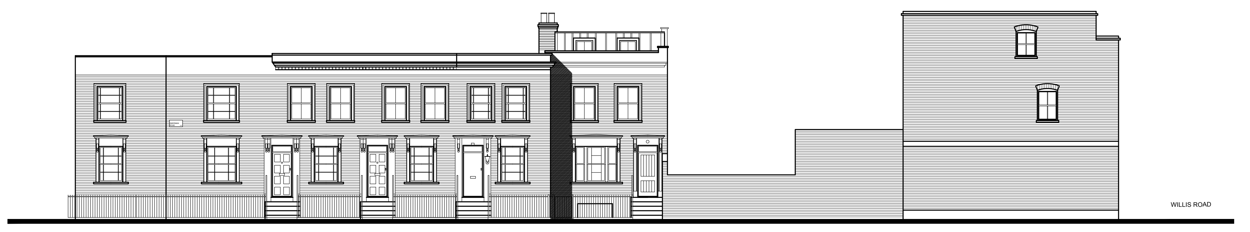
PROPOSED ELEVATION TO INKERMAN ROAD