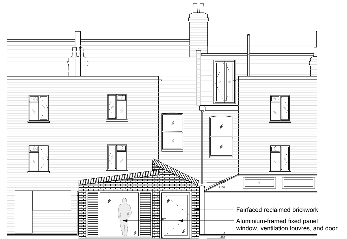
3 Proposed Rear Elevation