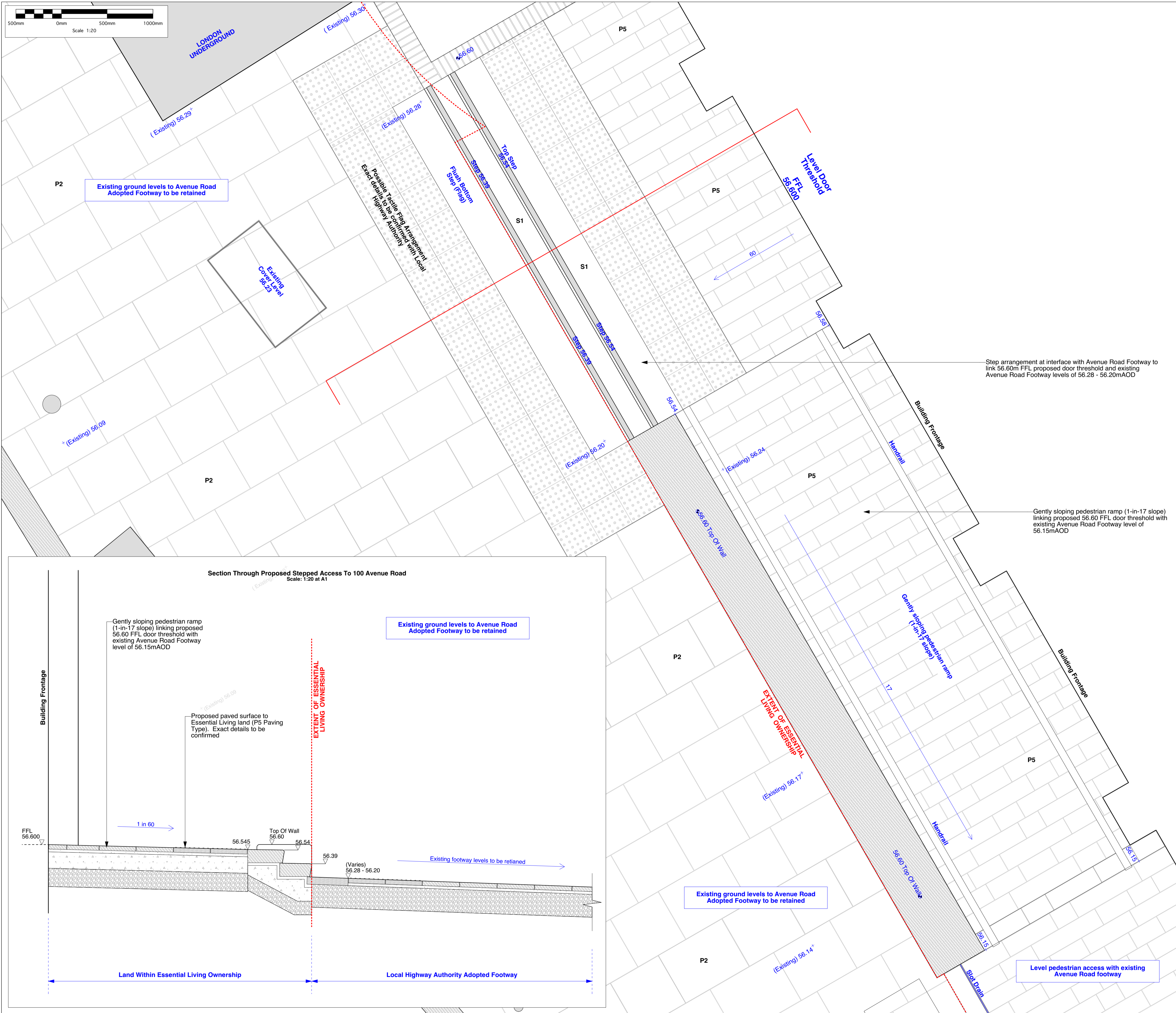
Section Through Proposed Stepped Access To 100 Avenue Road Scale: 1:20 at A1