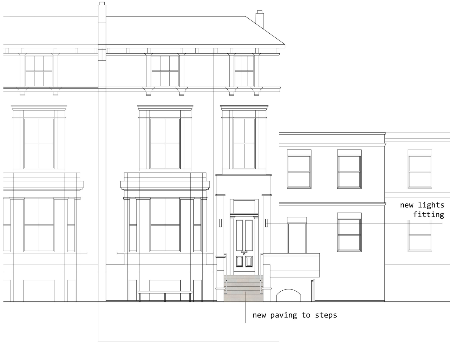
FRONT ELEVATION 1 to 100