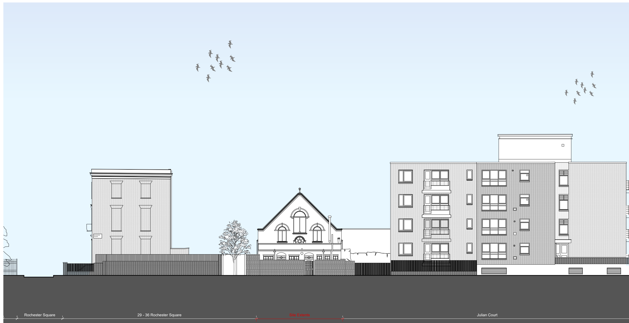
A | EXISTING ELEVATION - CC Rochester Sq. (north) 1:100 @ A1 / 1:200 @ A3